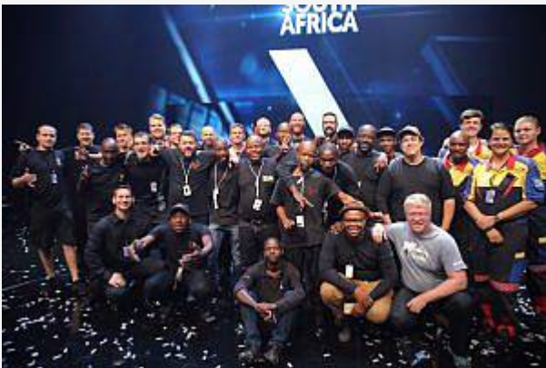
The fantastic crew who made it possible!

The surreal and massive opening saw flames and actors on stage in a “dark circus” type carnival, the Miss SA contestants gracing the ramp, adorned in dramatic designed apparel. The lighting then transformed to a classical look, the audience captivated this time by clean lines with a minimalistic feel.