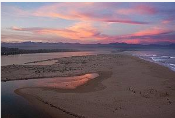
Sunset on the Kurbooms Lagoon.

Riaan points to a picturesque photo. “This is the view of the island on beautiful Keurbooms Lagoon, Plettenberg Bay. For three weeks every day, we got to experience sunrises and sunsets in one of the most beautiful parts of South Africa.”