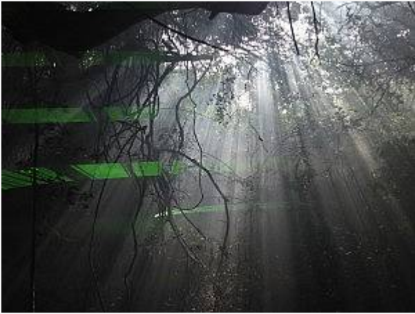
Lazers and haze created a lovely effect in the Forest Experience, also on the island.