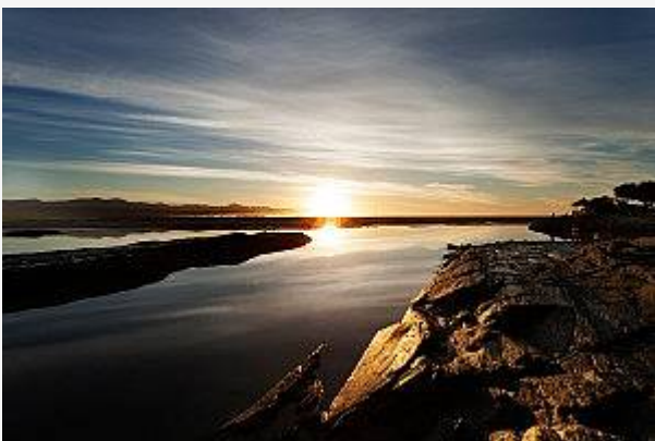
One more Plett sunrise.

While the setting is spectacular, the equipment moves from the mainland to the Island in stages, made possible by two barges, four 4x4 vehicles, ten 2-ton trailers and a tractor. The load-in takes the efforts of 20 crew members and an additional 60 casual staff per day and lots of sunblock!