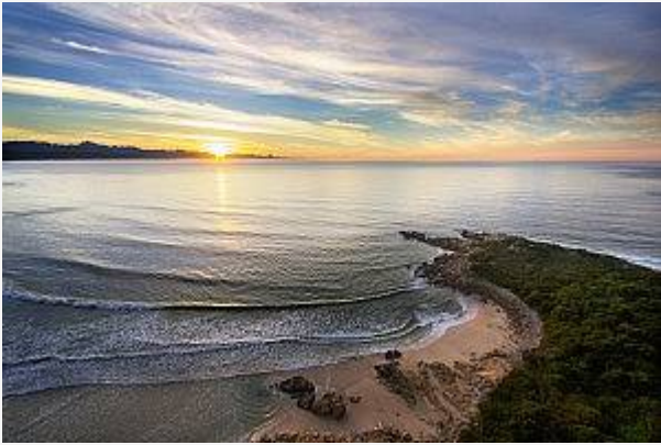
Sunrise on Lookout Beach.