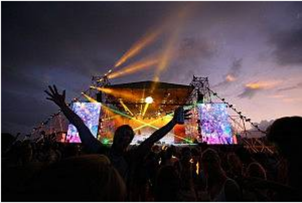
Republic of Extra Cold

Welcome to Castle Lite's Republic of Extra Cold , Stanley Island, Plettenberg Bay. It sounds exotic, and it is! On 28 Dec 2015, three thousand hip and savvy revellers gathered to enjoy SA's top acts and many unique and unexpected experiences in the extraordinary country which is the Republic of Extra Cold .