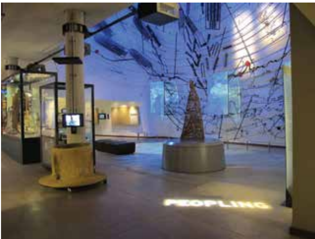
Freedom Park (Digital Fabric)