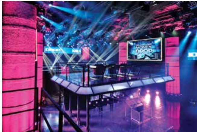
Money Drop Nigeria (Blond Productions)

From new television studio installations to providing itemised equipment, DWR service the television industry with quality products.