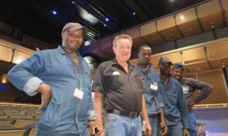
DWR at The American International School of Johannesburg