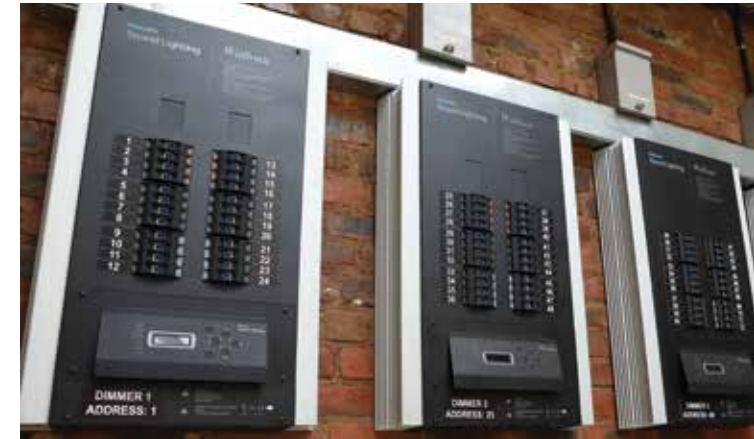
Dimmer replacement at The Atlas Studio in Milpark

It has been our pleasure to upgrade studios, including the M-Net SuperSport Studios, Red Pepper Studios, e-TV, Stark Films, SABC, Sasani Studios and The Atlas Studio.