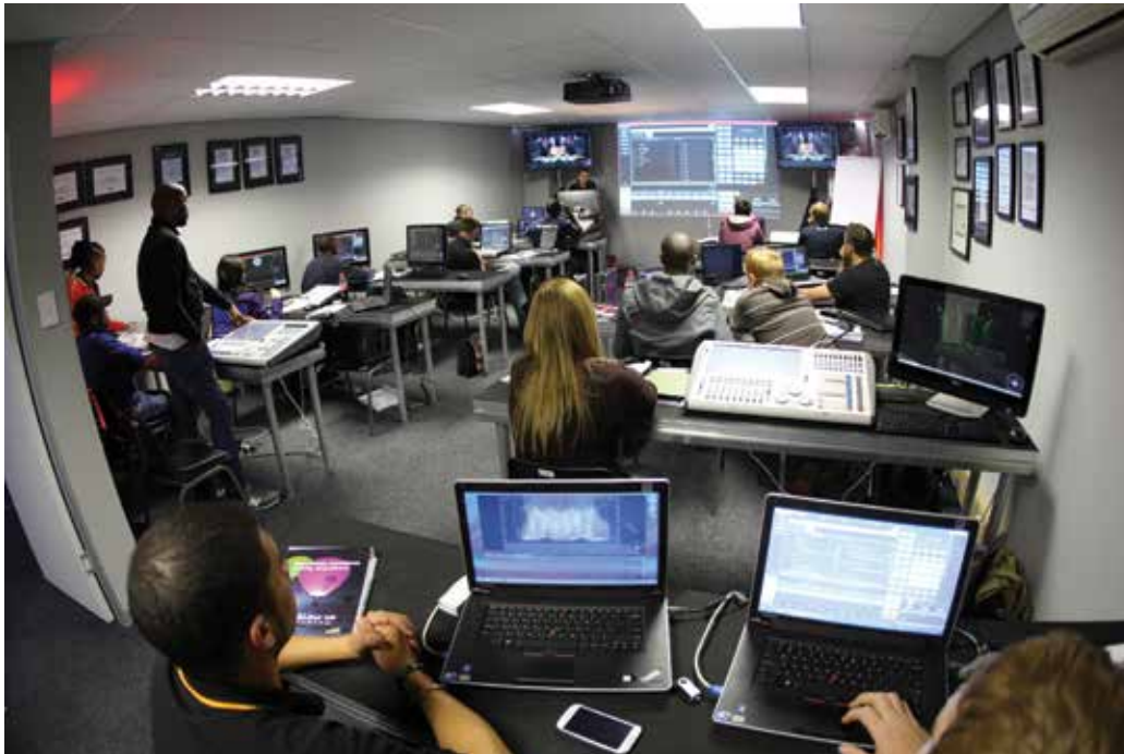
Training is a priority and regular courses are hosted at our premises. A wide range of topics are covered from product training to industry related subjects, such as rigging, first aid and fall arrest.