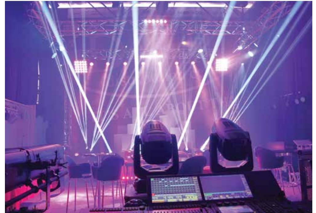
Our dedicated demo room gives clients the opportunity to see the effects and capabilities of each product. DWR also has a fully equipped workshop.