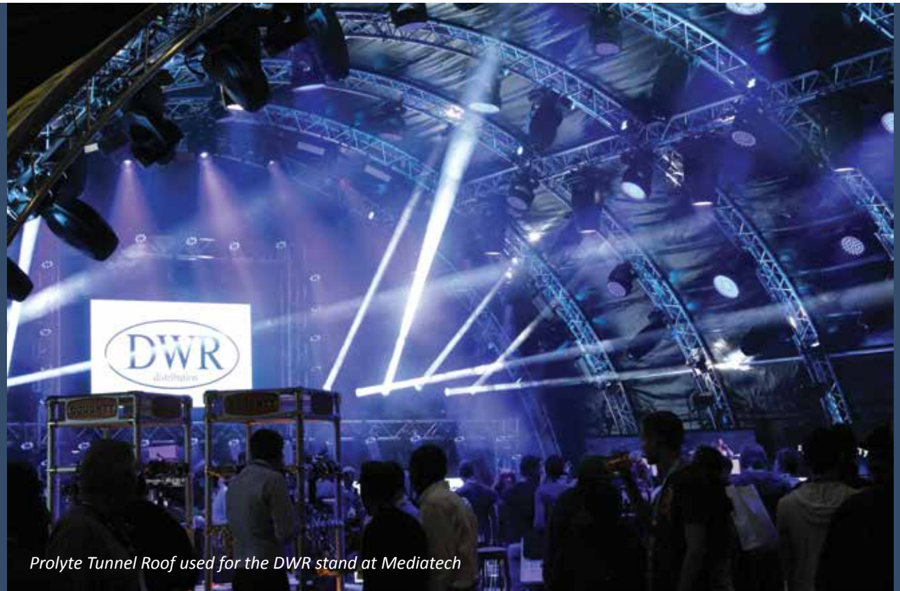
Prolyte Tunnel Roof used for the DWR stand at Mediatech

Prolyte is the world leading manufacturer of hardware products and structural solutions for the entertainment industry. DWR is the official representative of this product in Africa. Prolyte products range from trussing, staging and electrical hoists . Prolyte looks to support the creativity of designers on the one hand and the safety of both the technicians and the audience on the other.