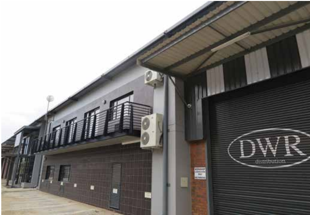
DWR Distribution is based in Johannesburg and has representatives in Cape Town and Durban