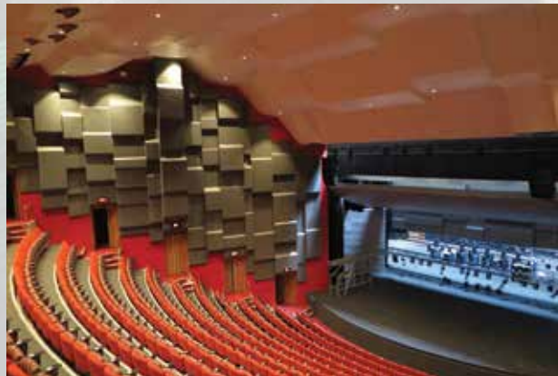
Etienne Rousseau Theatre Sasolburg (PJK Project Management)