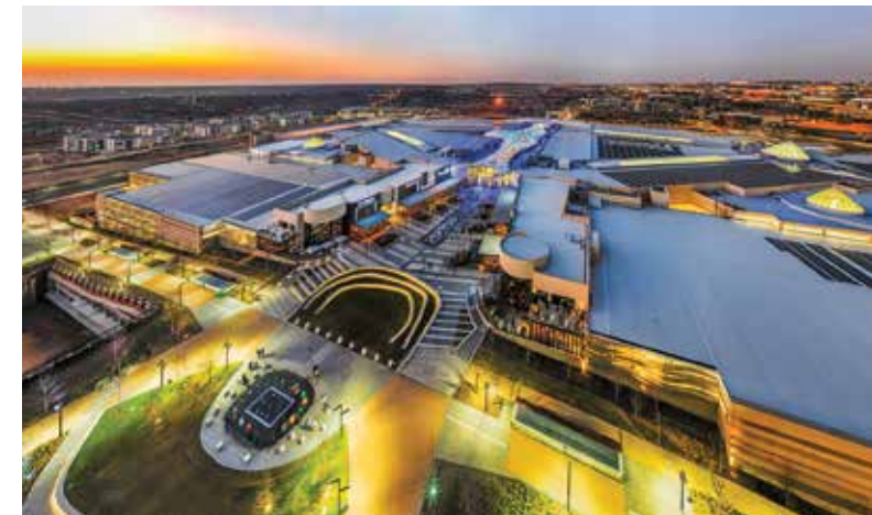
Mall of Africa