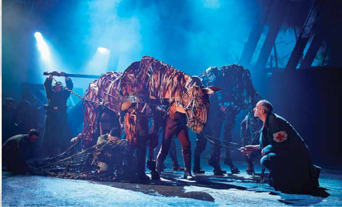
War Horse

In our Theatre Manufacturing Department, mechanical stage equipment as well as accessories such as curtain rails, steps and brackets are custom-made to service the industry.