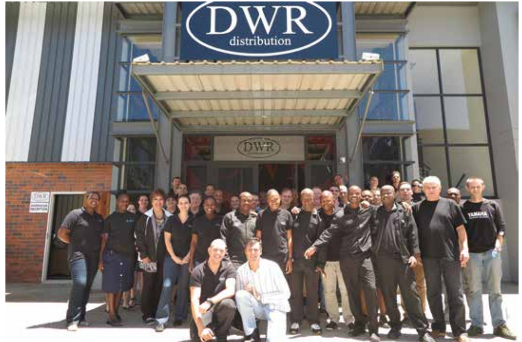
A team committed to service

DWR Distribution contact details: www.dwrdistribution.co.za