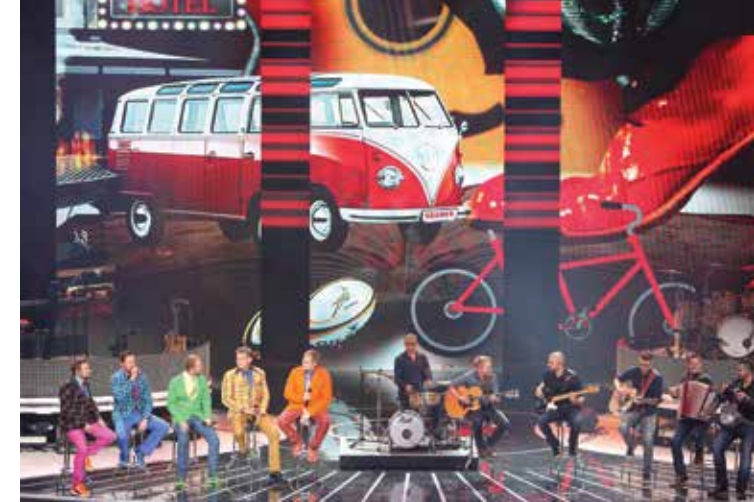
VuePix LED Screen forms a vibrant backdrop on Afrikaans is Groot (MGG Productions)

DWR offers powerful media systems that enables the user to visualise the show in 3D and precisely map it onto the set pieces.