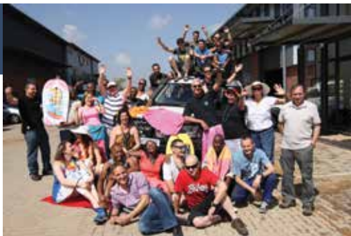
The DWR team (2014)

A double garage and a tiny office within a home in Weltevredenpark, Johannesburg, saw the start of DWR Distribution in May 2006.