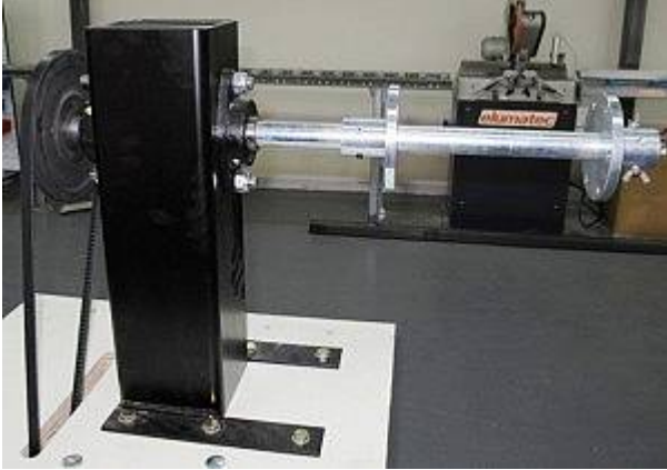
Custom Cable Reeling Machine