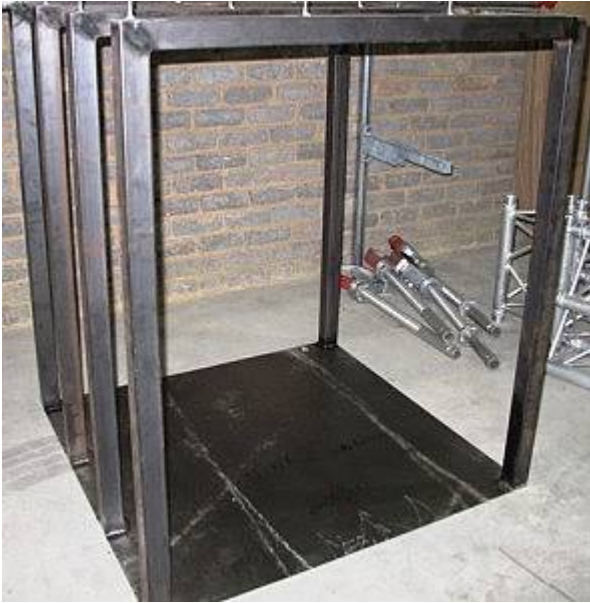
CO2 Cylinder holder