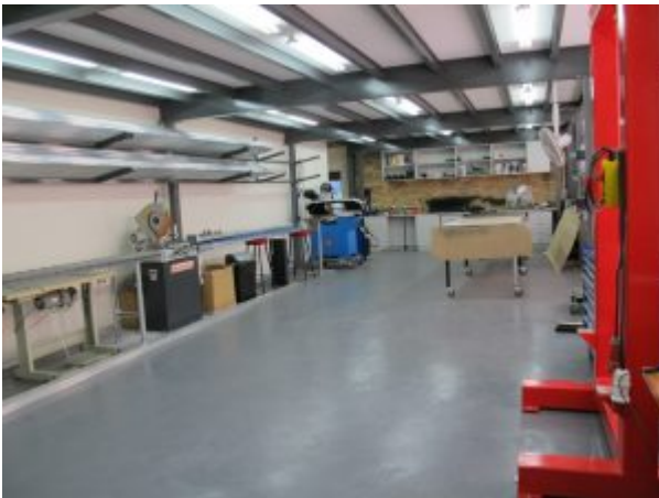
DWR Manufacturing Metal Workshop