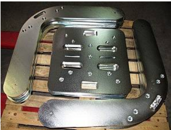
Banana base plates and top plates