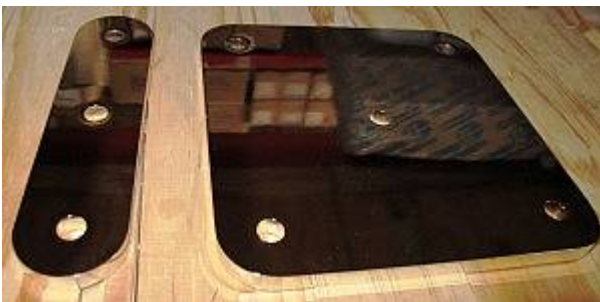
Castor Plates for Stagedex Legs