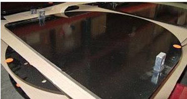
Vuepix LED Screen Base Plate