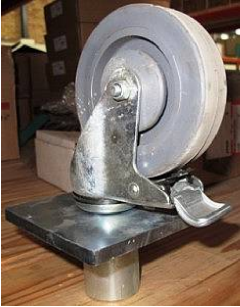
Deck Castor for transporting decks – loved by the crew