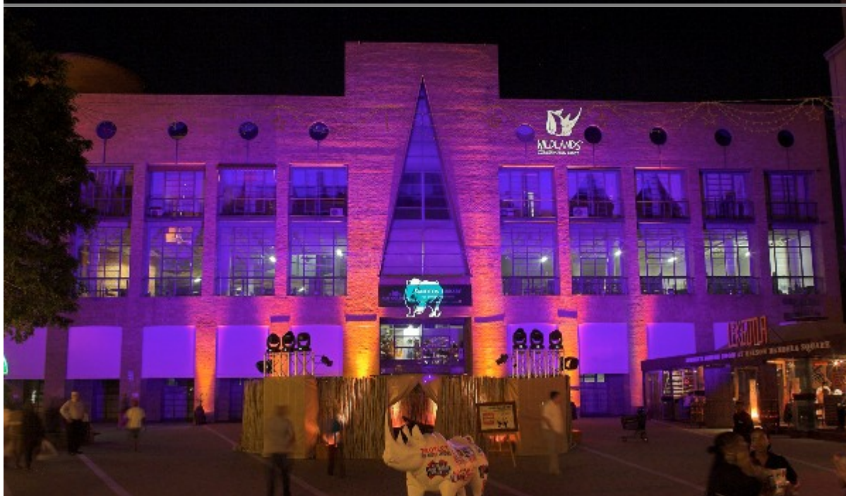
Six of the MMXs

were used to project a selection of fabulous patterns and 'liquid' animations on the front face of the Sandton Library building at the end of the Square, with two units swirling around a couple of striking Rhino logos. The nightly show was programmed by lighting designer Sean Rosig, and it ran for three weeks to raise awareness of the need to save these wonderful animals from extinction.