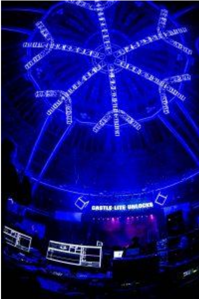
Truss Castle Lite Logo