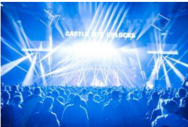
Castle Lite Unlocks