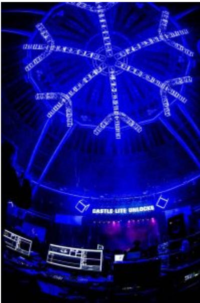
Truss Castle Lite Logo