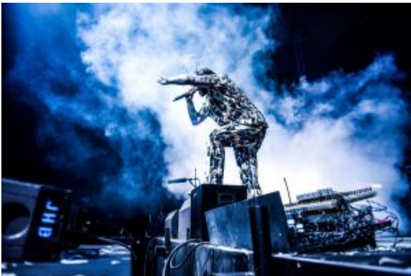
Castle Lite Unlocks Post Malone

With Vectorworks' integrated workflow, cross-platform abilities and valuable time-saving options like having the gear quantities worked out for you, the Spotlight package is a leading product in its field with many designers like Robert Grobler singing its praises. Robert closes off with saying "Vectorworks is invaluable to me".