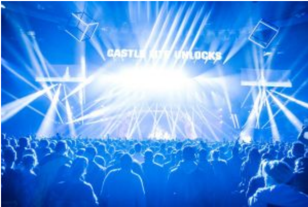
Castle Lite Unlocks