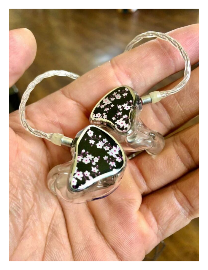
Contact DWR Distribution for more information.