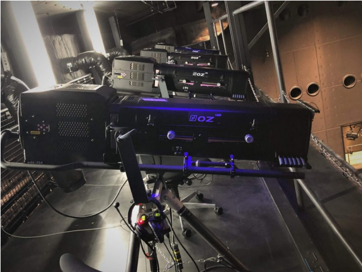
RJ Oz followspots installed FOH at Zepp Haneda

A subsidiary of Sony Music Entertainment (Japan) Inc, Zepp concert halls are dynamic, busy venues which are spread across all areas of Japan and beyond. The venues play host to many international tours and Japanese musicians and are also popular locations for corporate events and conventions.