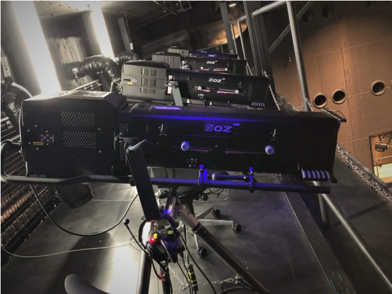
RJ Oz followspots installed FOH at Zepp Haneda