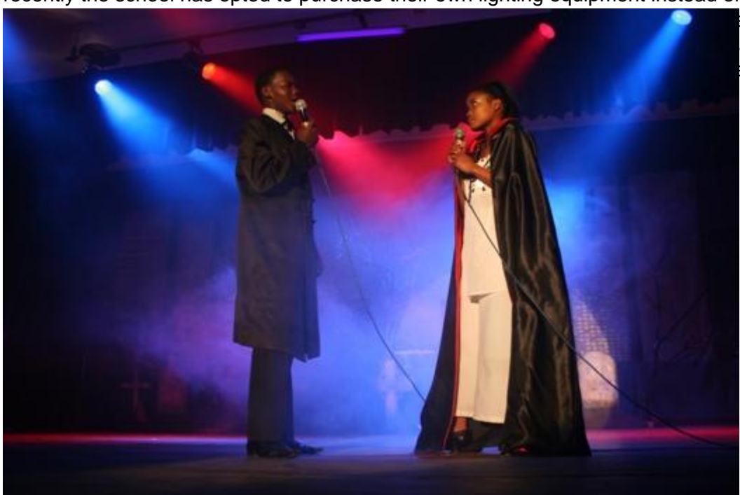
ed in Pretoria, South Africa is ast 70 years. The school was est known to have written the

ordinates entertainment events at Hoërskool Langenhoven, has taught accounting for the past 18 years. Winds of change have seen the school move from an all white Afrikaans school to a now black English School. More recently the school has opted to purchase their own lighting equipment instead of hiring as they did in the past.