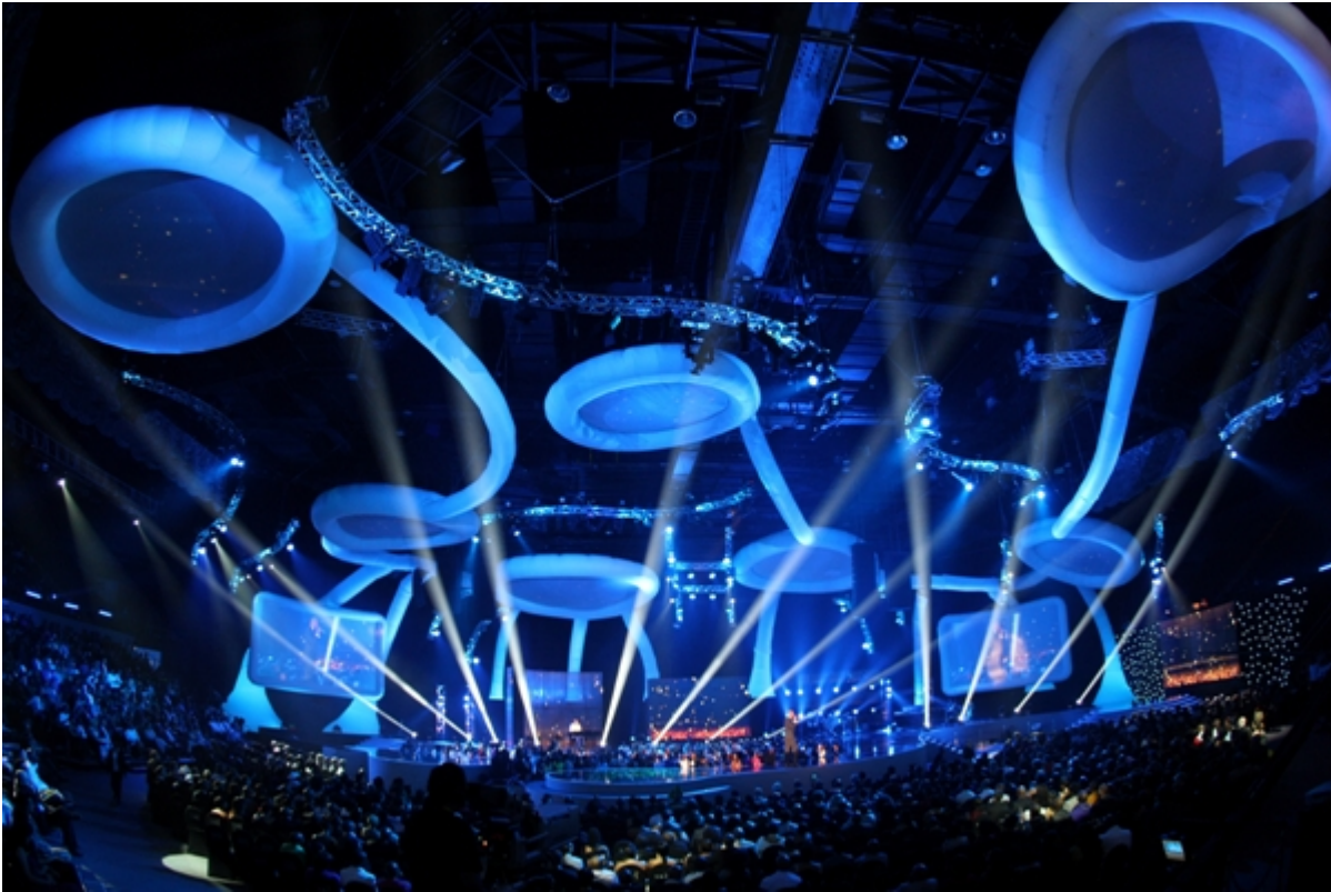
It was the biggest

set Dream Sets had ever built with the most lighting and AV. The 18th Annual MTN SA Music Awards, held at Sun City, looked simply phenomenal.