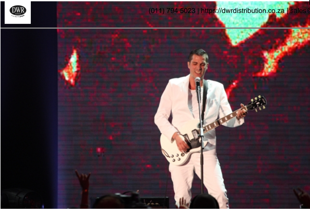
The clock ticking