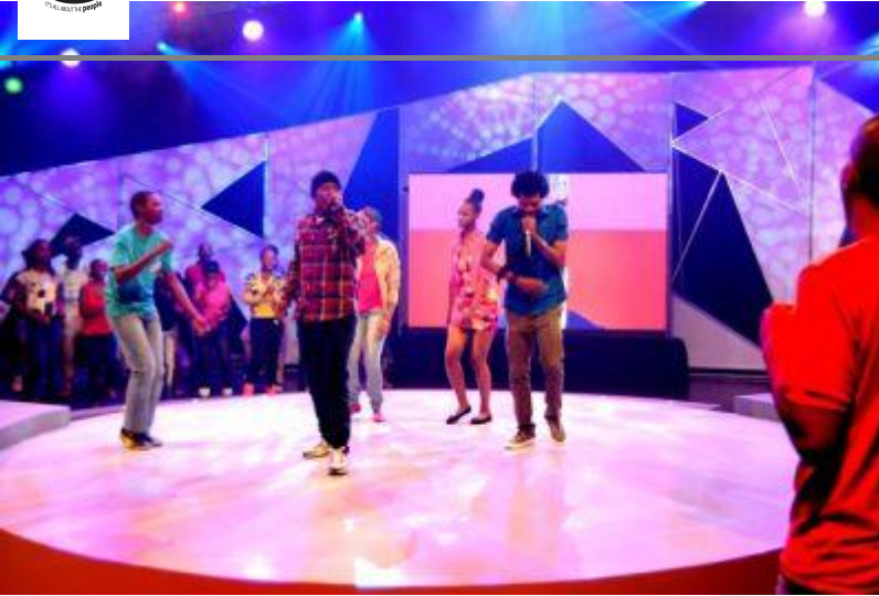
Recorded in Studio 7, one of the larger studios