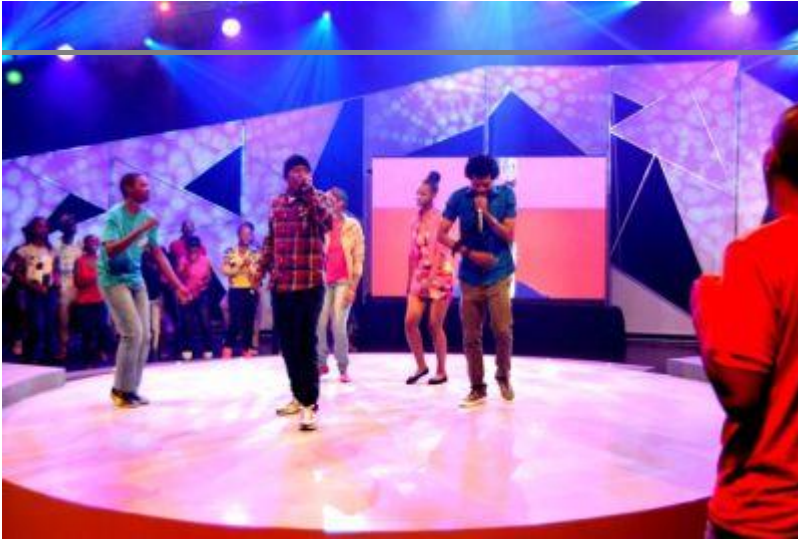
Recorded in Studio 7, one of the larger studios