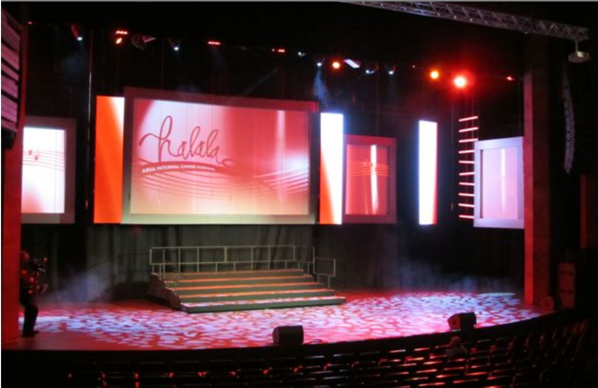
At the Teatro at

Montecasino, Showgroup used 16 Robin 300, 8 x VLX Washes, and VL 2 500 Spots for the seventh annual ABSA Choir “Halala Festival”. Andries hired in a grandMA for the show.