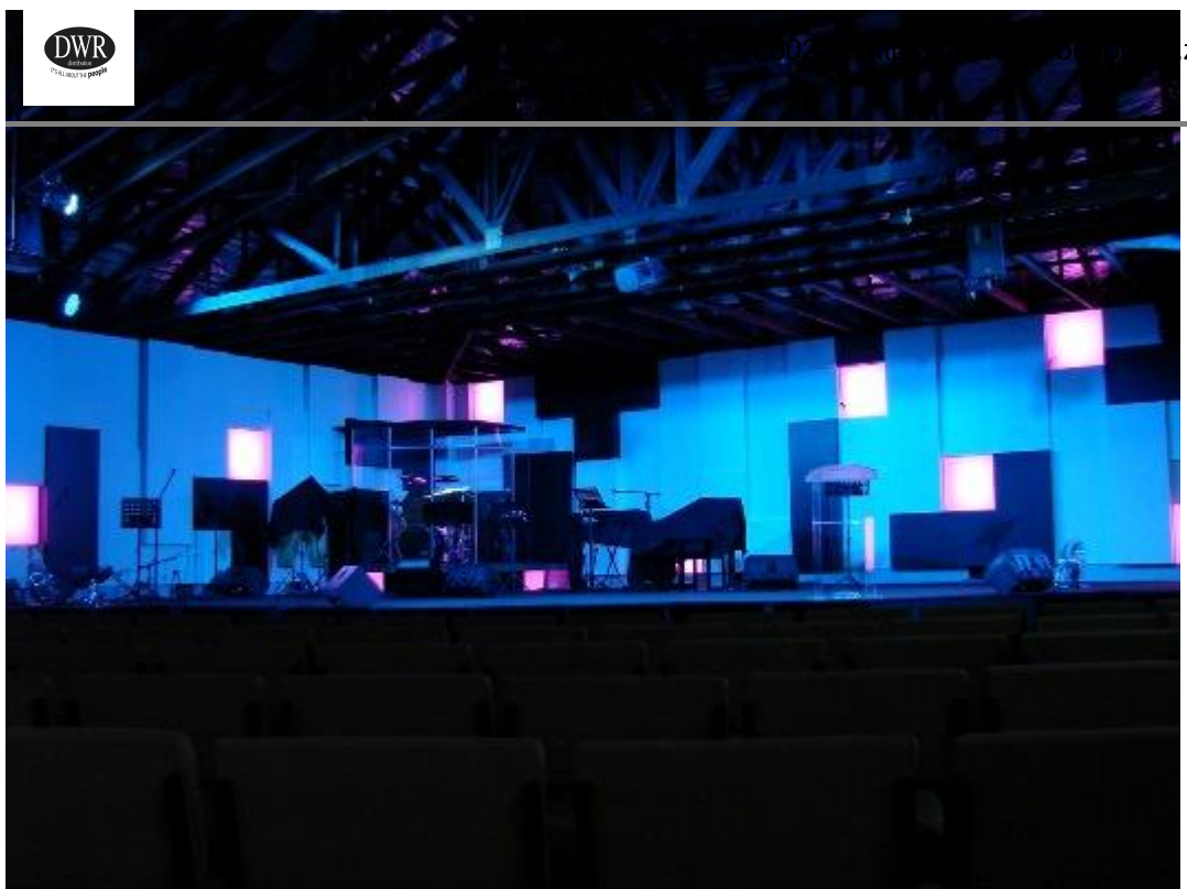
The four Robin LEDWash

600s have been rigged from roof trusses in the auditorium and Chris is pleased with their performance. "They are as versatile as the units in my dreams," he laughs. "Humour aside, I do not know what they will do to improve on this. Light on power consumption, high on output, an almost everlasting lamp life, lightweight, fast, zoom! Colour correction and they can be addressed and personalized without any power to the unit." For the time being, the team at Soteria are handling the fixtures with care and a little caution, but it will only be a matter of time and they'll have the confidence and familiarity to create fantastic new looks and an ambience to compliment meetings and special events.