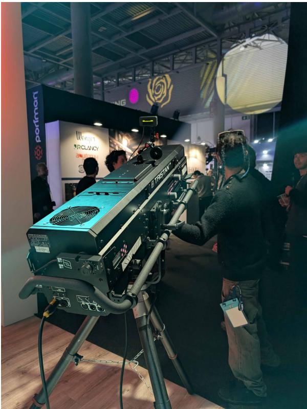
(Above): RJ's new Tristan followspot being tested by a curious visitor to the stand

Tristan and Morgane offer advanced new features that include, for the first time, a motorized iris which can be controlled remotely as well as locally. New mounting positions have been added to adapt photo-compatible accessories and, in particular, integrate a remote display that provides real-time information such as the iris size and light intensity directly on a display with a direct view of the light.