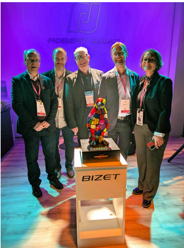
(Above): The Robert Juliat team on the ISE 2026 stand

In an exhibition the size of ISE it takes a lot to make an impression, but the new addition to Robert Juliat's Bizet family of profiles and Fresnels managed to do just that with the World Premiere of the brand-new Bizet 8-Colour Fresnel .