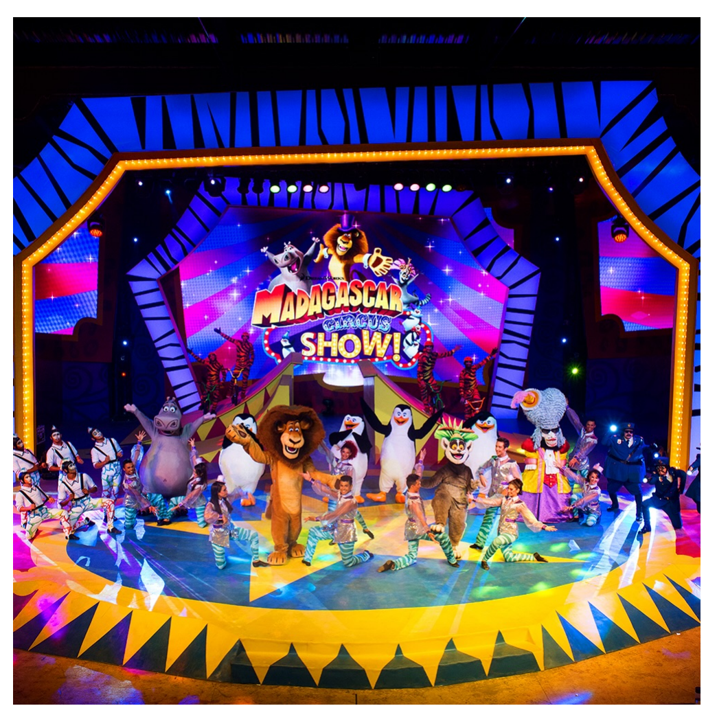
Madagascar Circus Show

Robert Juliat Arthur followspots make their South American debut at Beto Carrero World