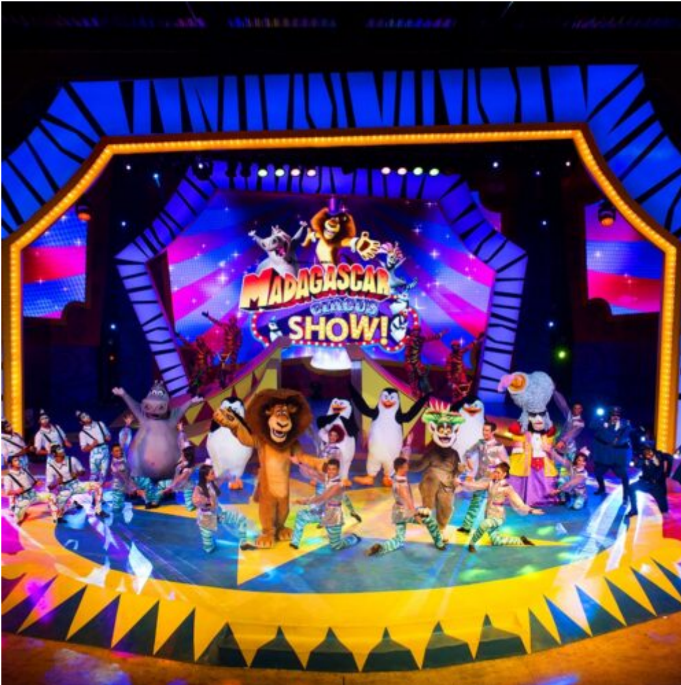
Madagascar Circus Show

Located in Penha, Santa Catarina, Brazil, Beto Carrero World is the largest theme park in South America. Amongst its many attractions is the big, bright and colourful Madagascar Circus Show, a musical extravaganza themed on the third in the children's film series Madagascar , in which the characters dance and perform incredible circus stunts.