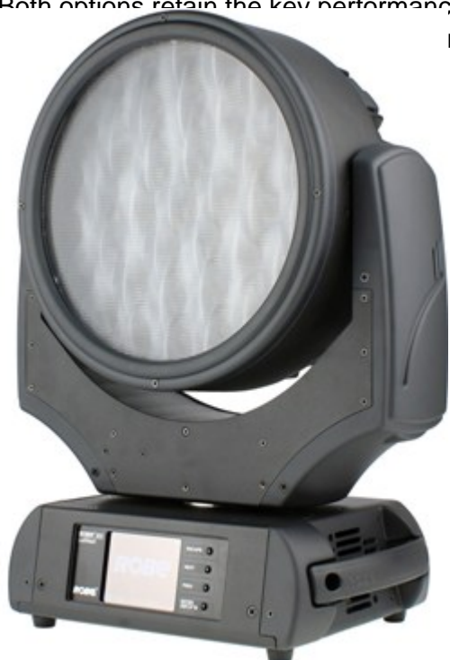
Robin 800 LEDWash The world's first LED wash light with beam

Both options retain the key performance features of the MMX family – full CMY colour mixing, saturated colour control, motorised zoom & focus.