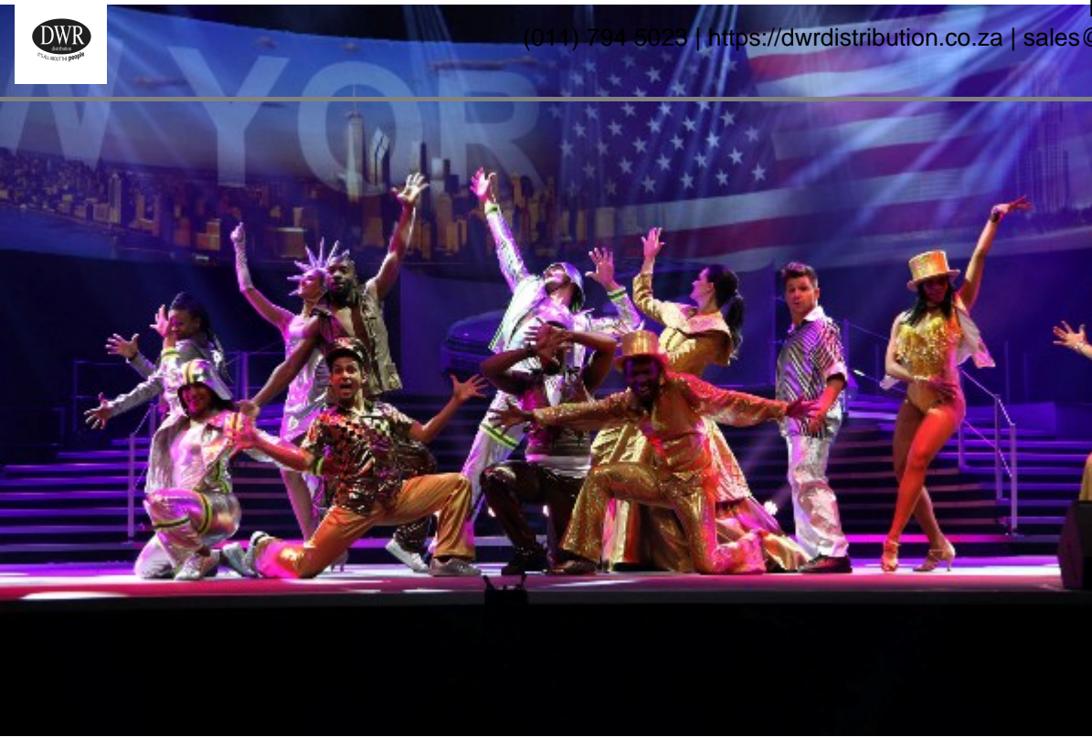
A large trussing

system was installed over the 30 metre wide stage, based on three concentric circles with a series of trussing spines coming off the largest circle on the outside of the two smaller ones.