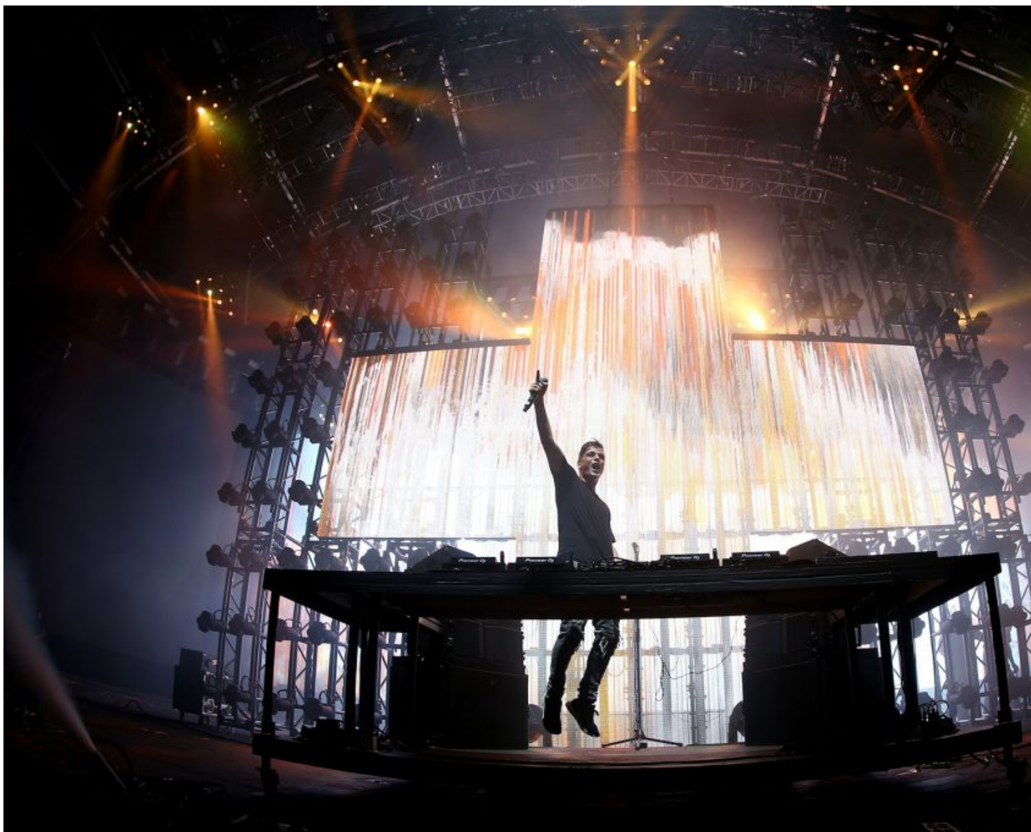
INDIO, CA – APRIL 15: DJ Martin Garrix performs on the Sahara Stage during day 2 of the Coachella Valley Music Festival (Weekend 1) at the Empire Polo Club on April 14, 2017 in Indio, California on April 15, 2017 in Indio, California.

rock, indie, hip-hop, R 'n' B and EDM to name a few – plus art installations and sculptures.