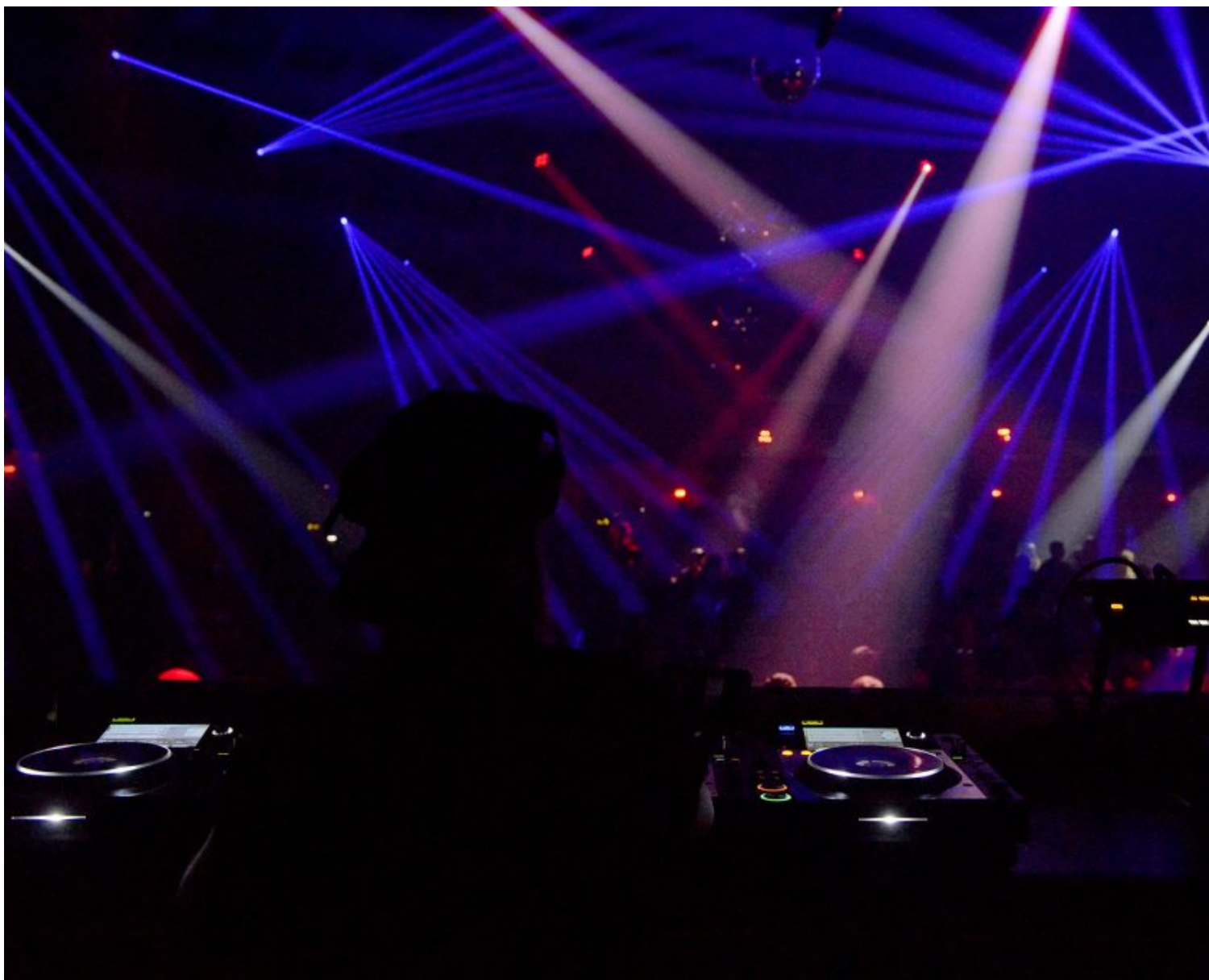
INDIO, CA – APRIL 16: Maya Jane Coles performs in the Yuma tent during day 3 of the Coachella Valley Music and Arts Festival (1) at the Empire Polo Club on April 16, 2017 in Indio, California.