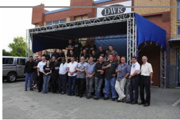
The DWR Team