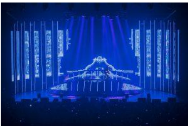
By Louise Stickland

One of Romain’s inspirations for this show was wanting to bring a super-powerful lightsource onstage ... and you can’t get anything more astronomically awesome ... than the sun!