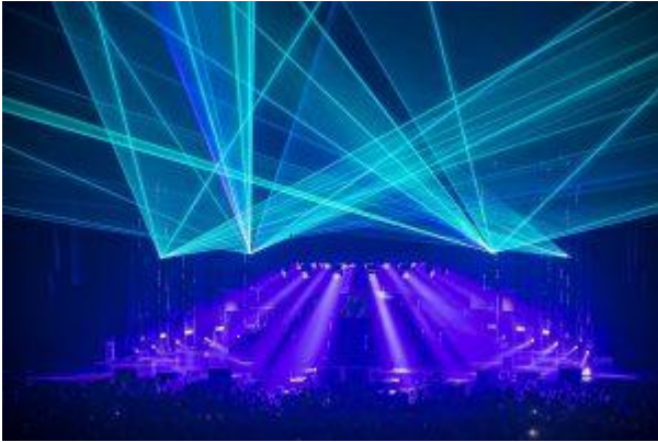
By Louise Stickland

“For this design we needed a video presence, but I really wanted the stage to have a strong lighting base,” he says “to use video in a more subtle and understated way and for lighting to have a very powerful presence”.