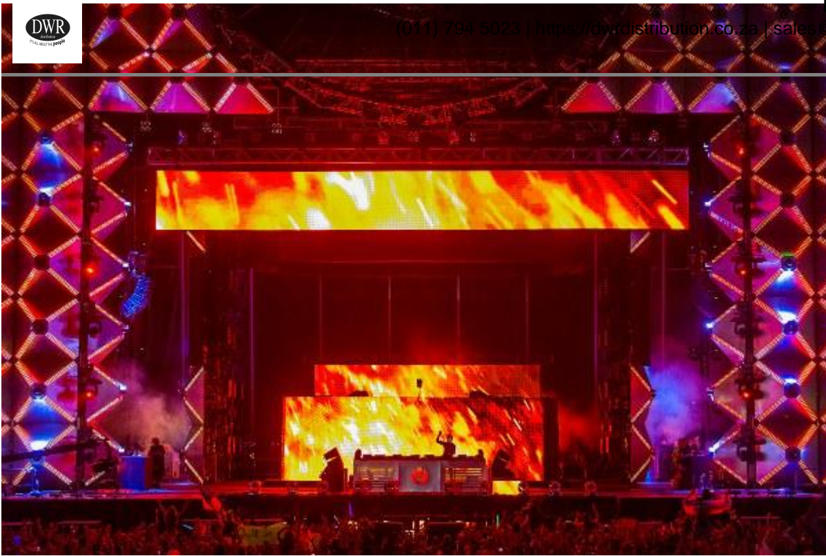
The light weight

was also essential for the way they were used and to enable 176 of them to be utilised on the structure without significantly adding to the rigging requirements!