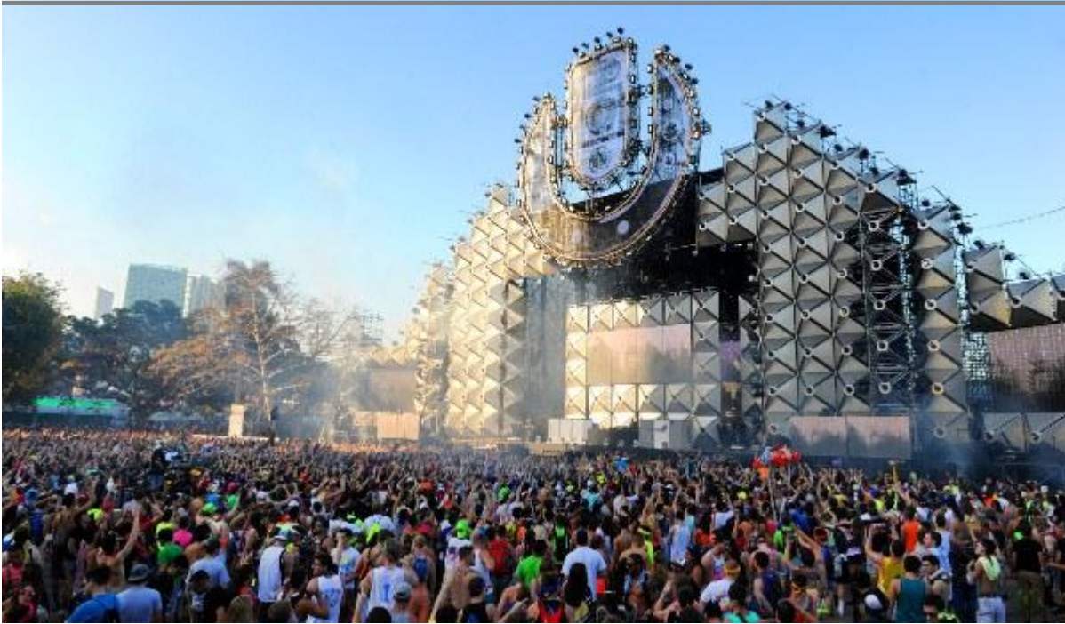
The 200 ft wide

set was built by Tait Towers and included the 176 scenic pyramids each of which were clad in 40 panels of Tait's now famous Pixel Tablets.