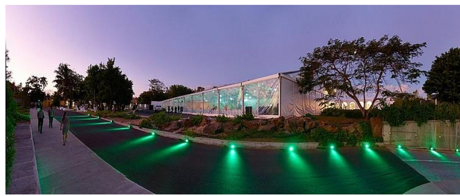
Equipment and crew was supplied by the two companies, which both have a reputation for technical excellence.

Multi-Media provided specialist projection, screens and control – deployed at two of the sites – plus six crew; while all tents, sound, lighting and staging for all the evening activities together with crew came from Impact.