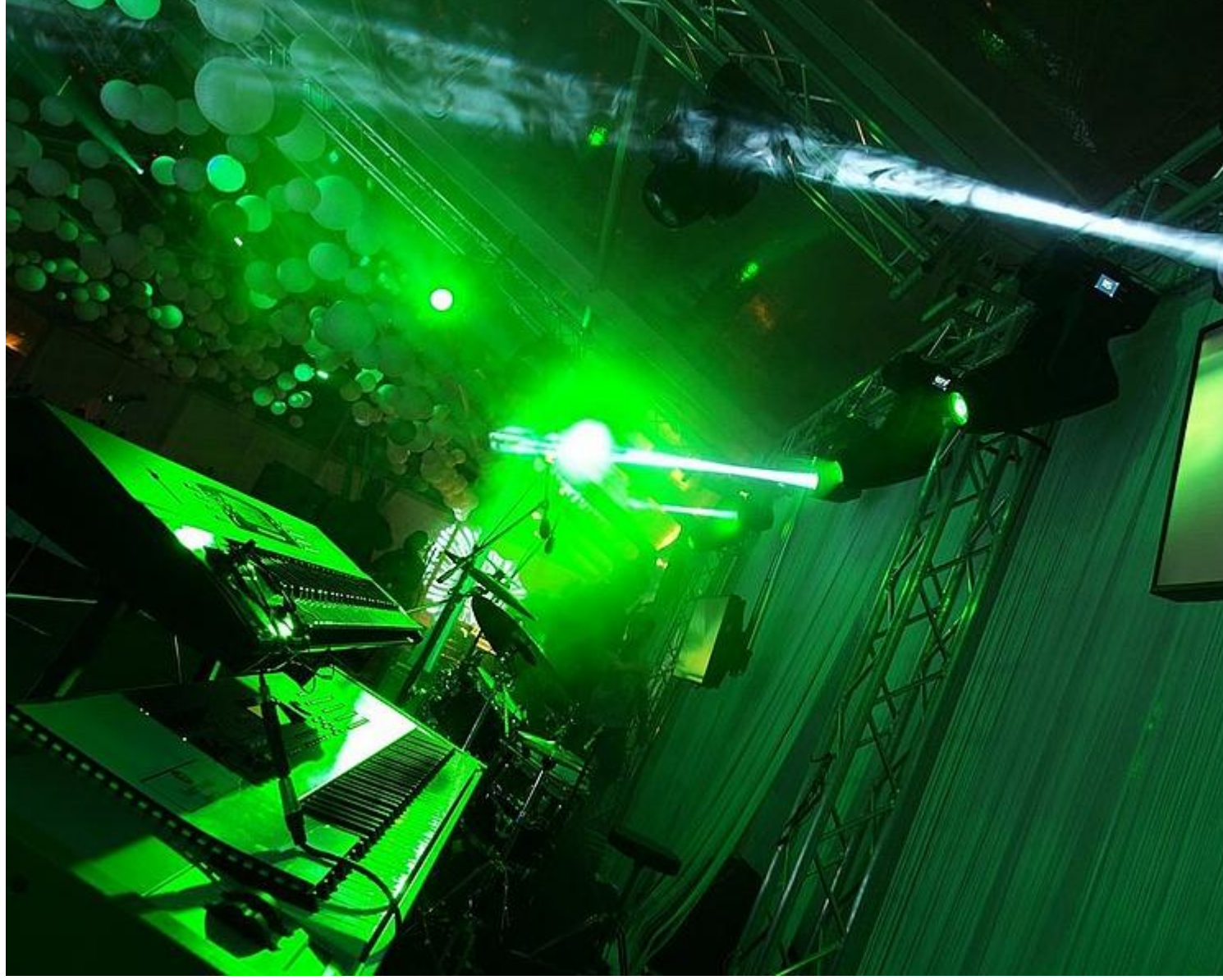
He adds that it was a great opportunity for the Multi-Media and Impact crews to share and interchange some of their skills, knowledge bases and work ethics together.