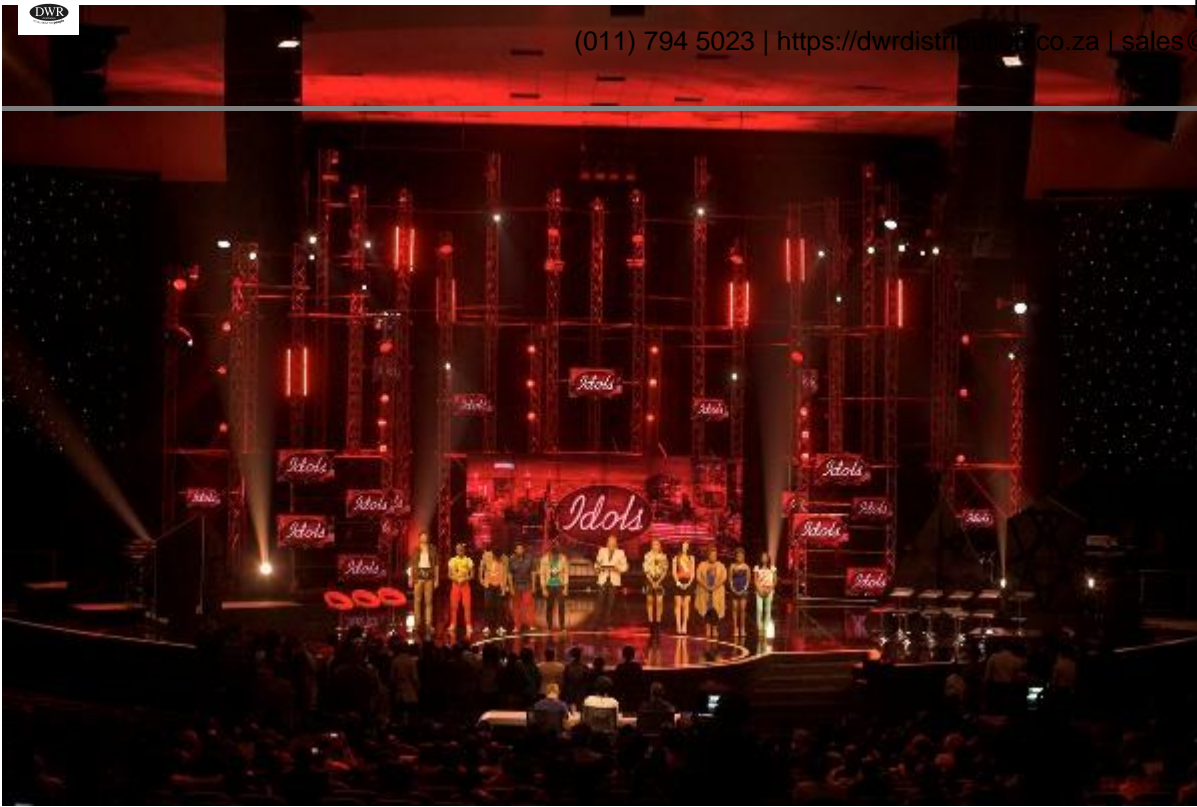
It's the fourth