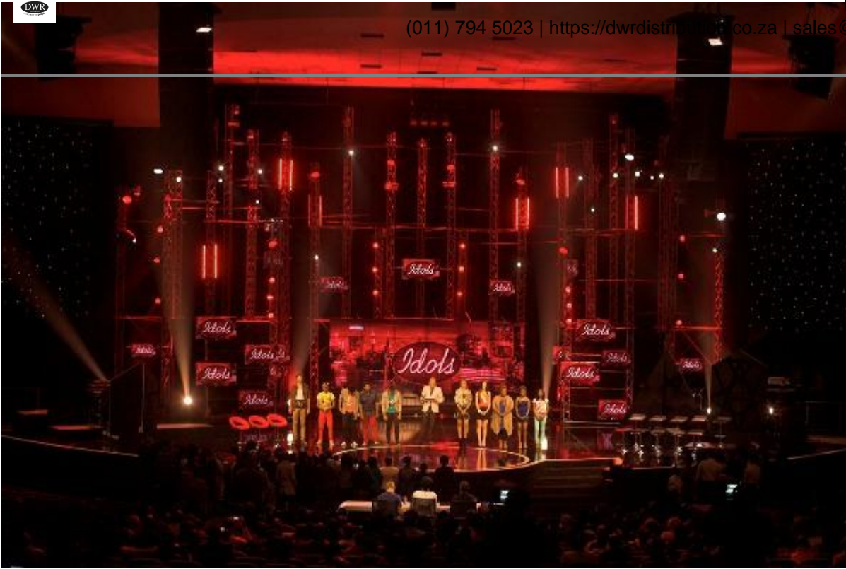
It's the fourth