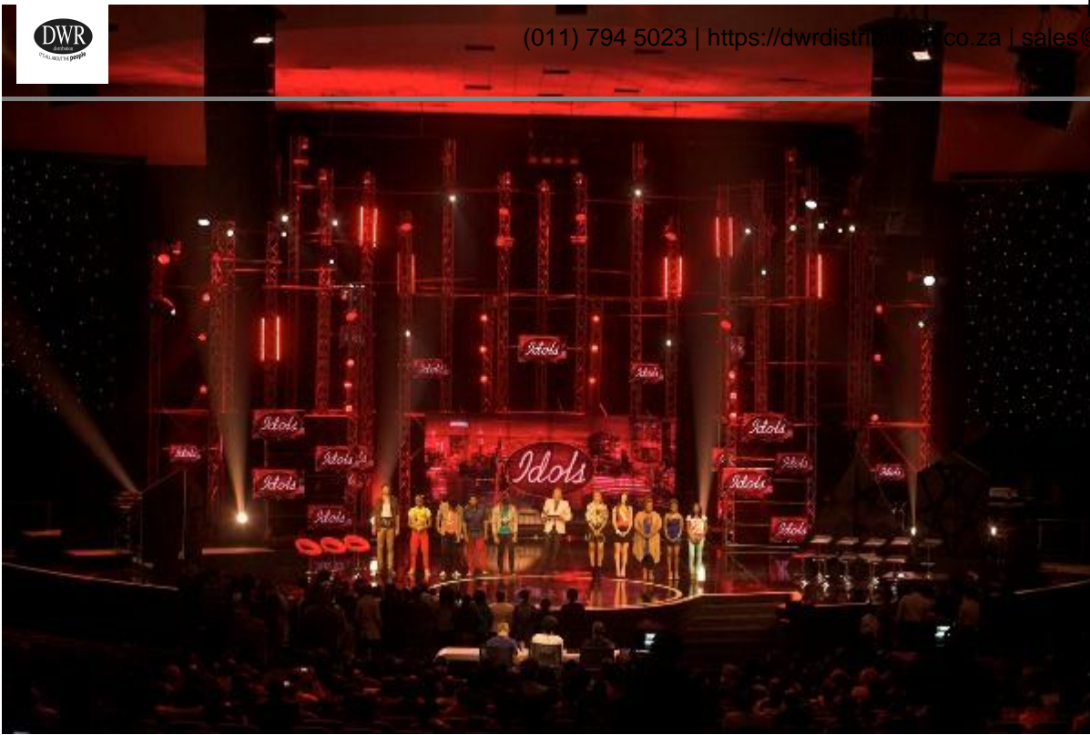
It's the fourth