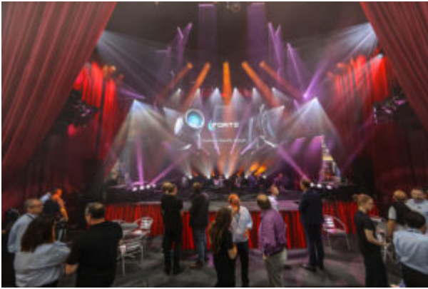
By Louise Stickland