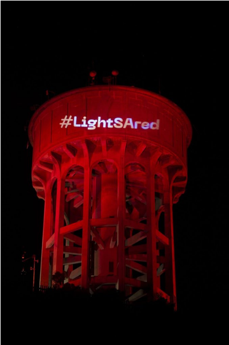
#LightSARed Northcliff Water Tower