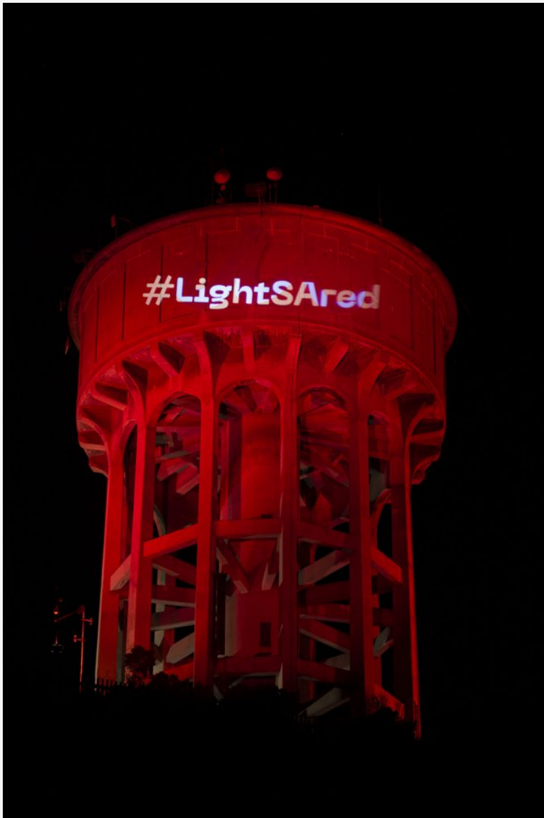
#LightSARed Northcliff Water Tower