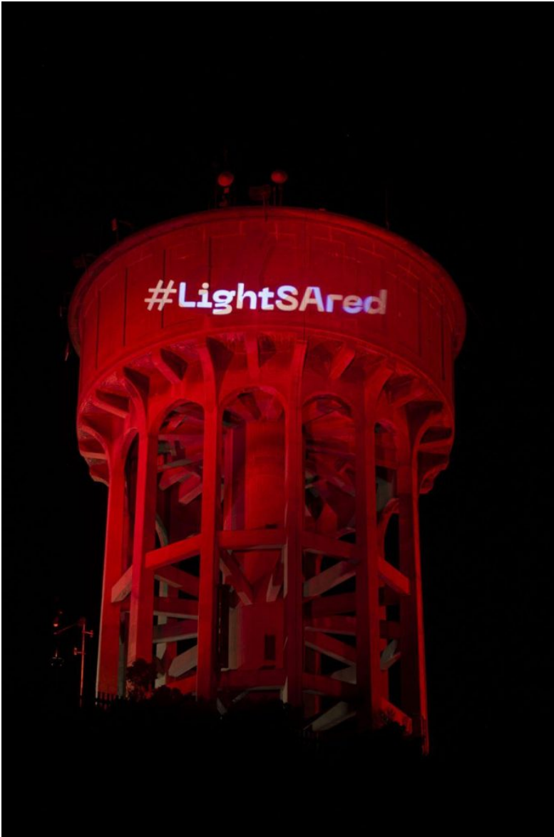
#LightSAred Northcliff Water Tower