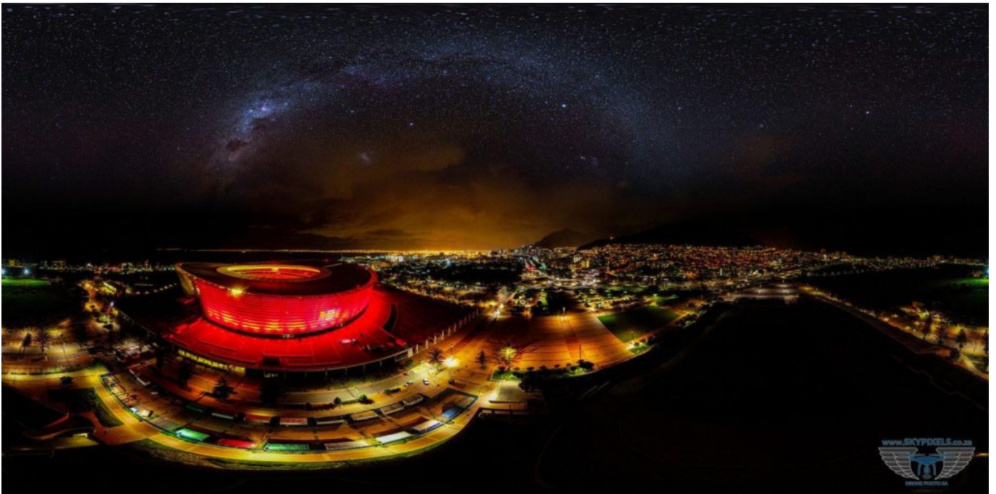
SkyPixels SA did the amazing drone footage of Cape Town Stadium

Cape Town Stadium was beautifully lit by rental company CCPP using 24 x Spiders and 24 x BMFLs.