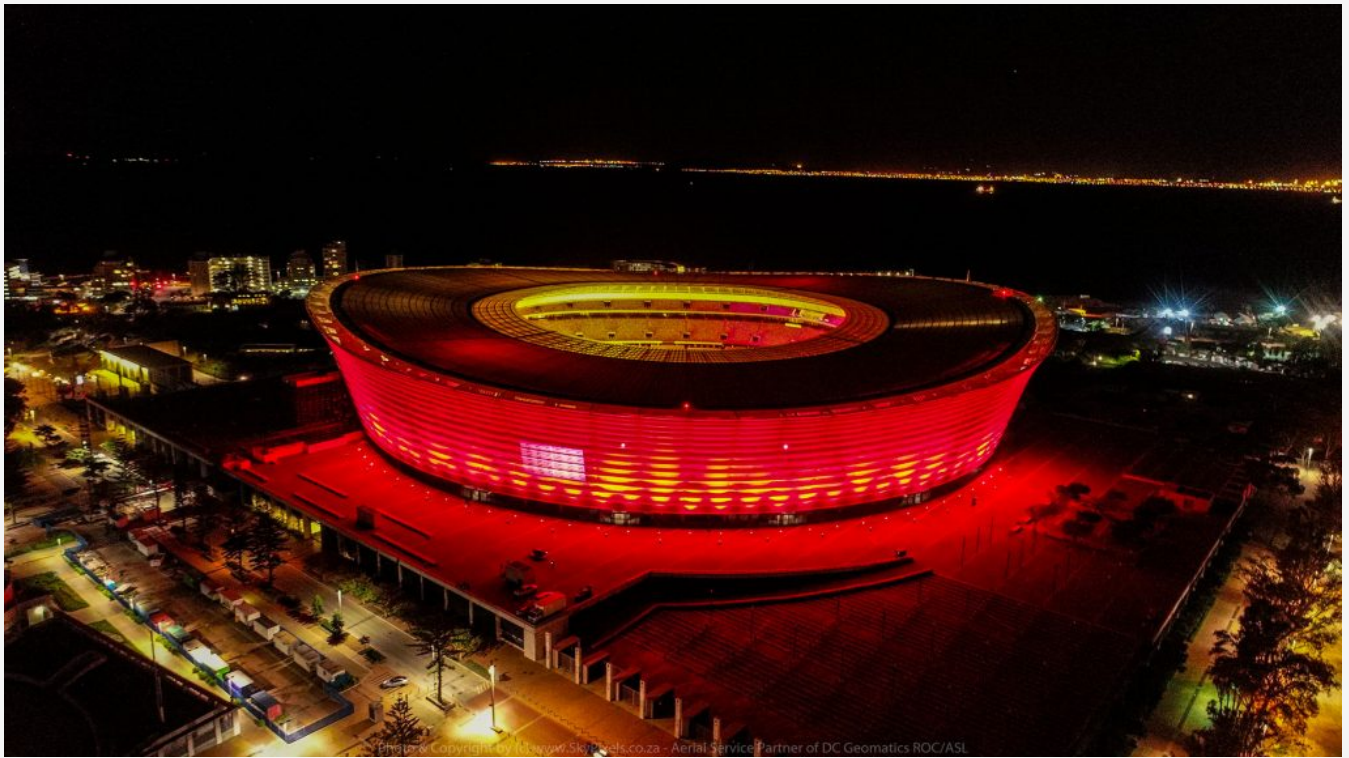
Cape Town Stadium