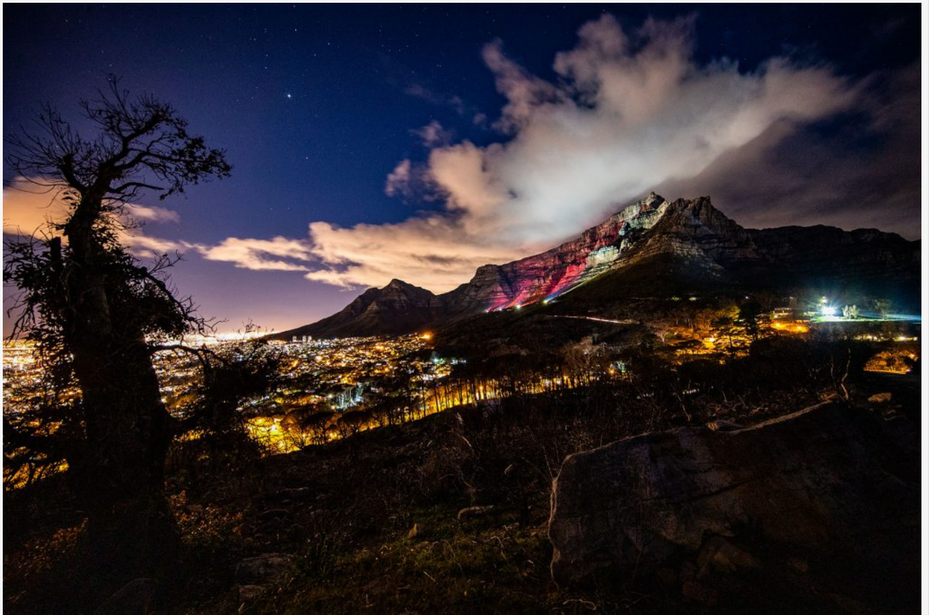
Table Mountain