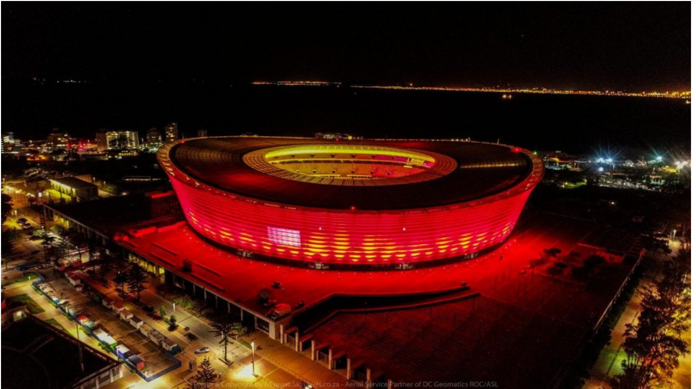
Cape Town Stadium

The South African entertainment industry unified en mass for their August 5 th #LightSARed 'Code Red' activation ... to shout out the critical state of the live entertainment industry and its support infrastructure, which has had no work, no cashflow – and no meaningful government support – for 5 months since mass gatherings were banned on March 15th due to the Coronavirus pandemic.