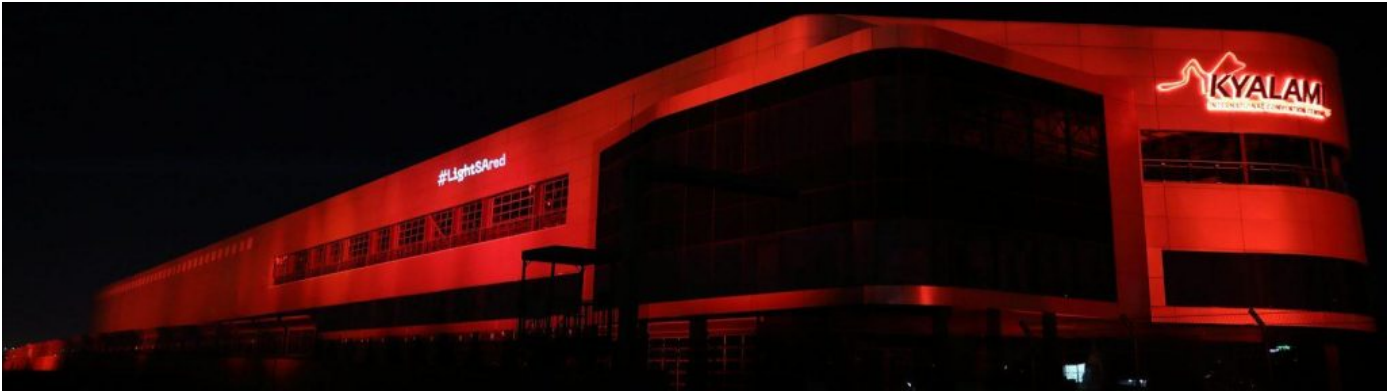
Kyalami Expo Centre

Cape Town Stadium was beautifully lit by rental company CCPP using 24 x Spiders and 24 x BMFLs.