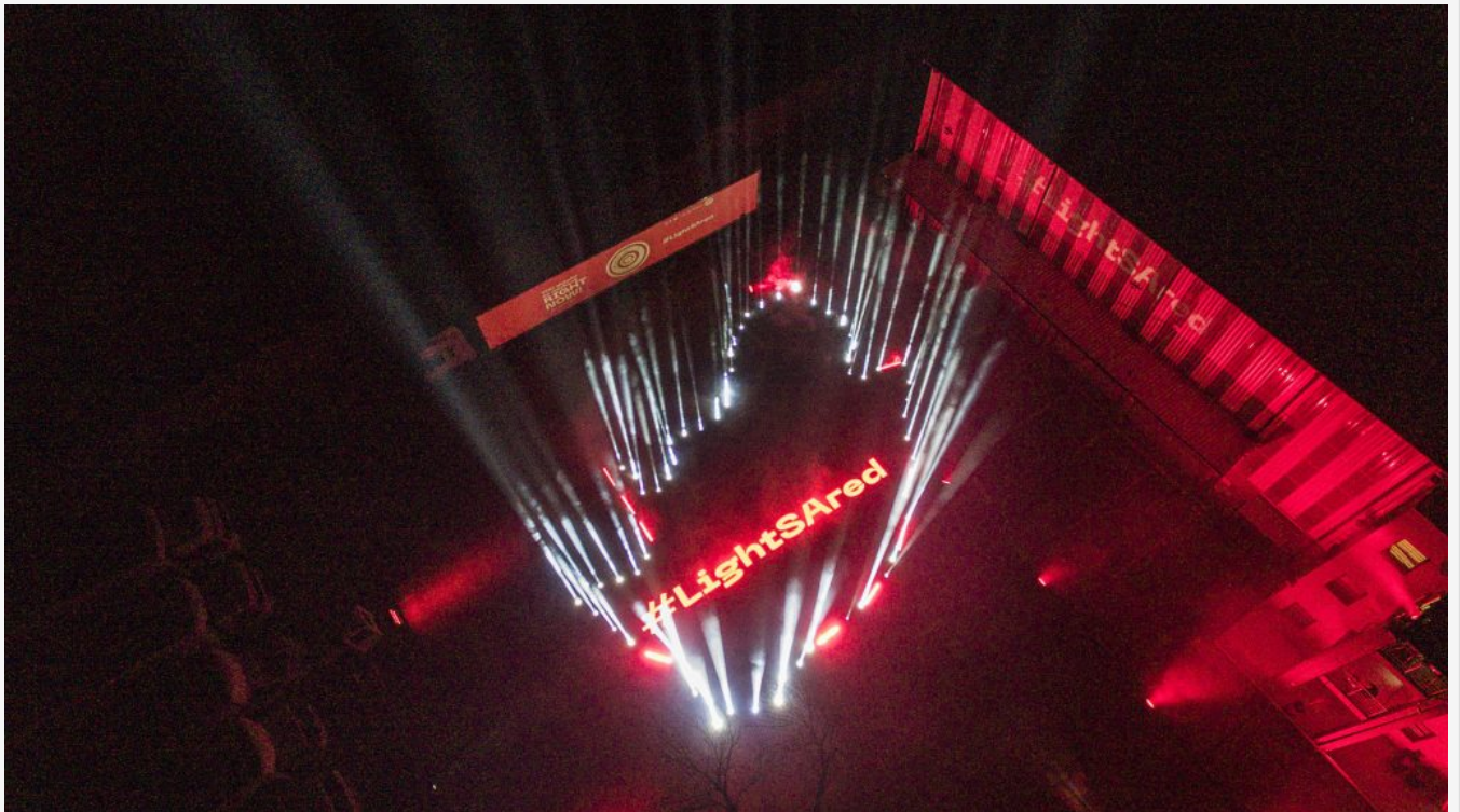
MGG Warehouse

comprised six Robe DL4S Profiles, 16 x LEDWash 600s and four PATT2013s.