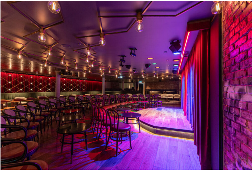
Attic Comedy Club

Icon of the Seas , Royal Caribbean International's™ new game-changing ship, is setting new jaw-dropping standards and records in the world of vacations.