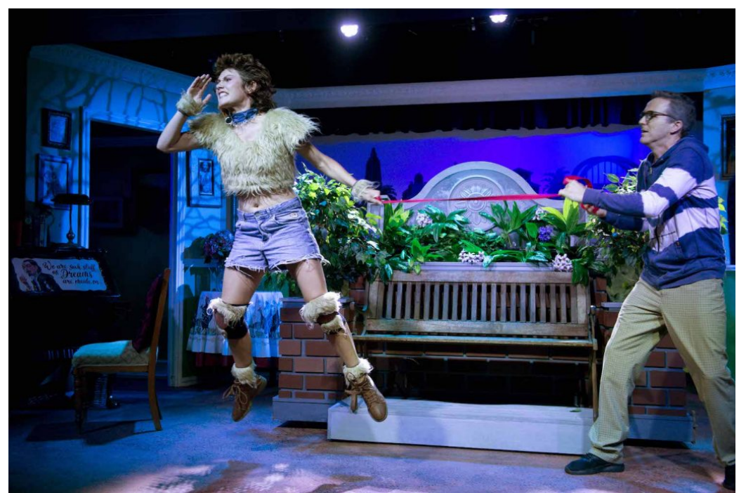
Sylvia, the first production in the renovated Seabrooke's Theatre.

Revamped Seabrooke's Theatre opens with a laugh!