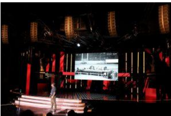
Tony Szabo, Head of Touring Applications at L-Acoustics

With 24 per cent of the L-Acoustics team in R&D and application engineering across disciplines beyond pure audio, such as mechanical and fluids engineering, software, embedded electronics, and material science. When you buy L-Acoustics, you can be assured that you are investing into research and development.