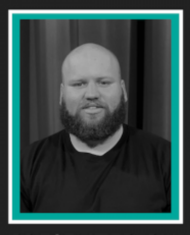
PRESENTED BY DYLAN JONES