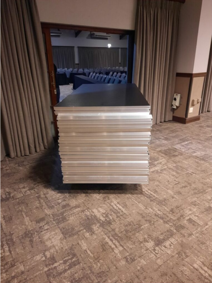
CS Prouctionz's new Prolyte StageDex at a corporate event.