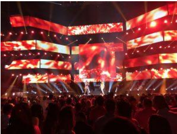
Zion & Lennox

Expanding on the Timeline and other Hippotizer features, Toro says, “The Timeline is out of control! It’s got to a point where there is nothing now that you cannot program in or outside the media server. You never stop learning this feature to its full capabilities.”