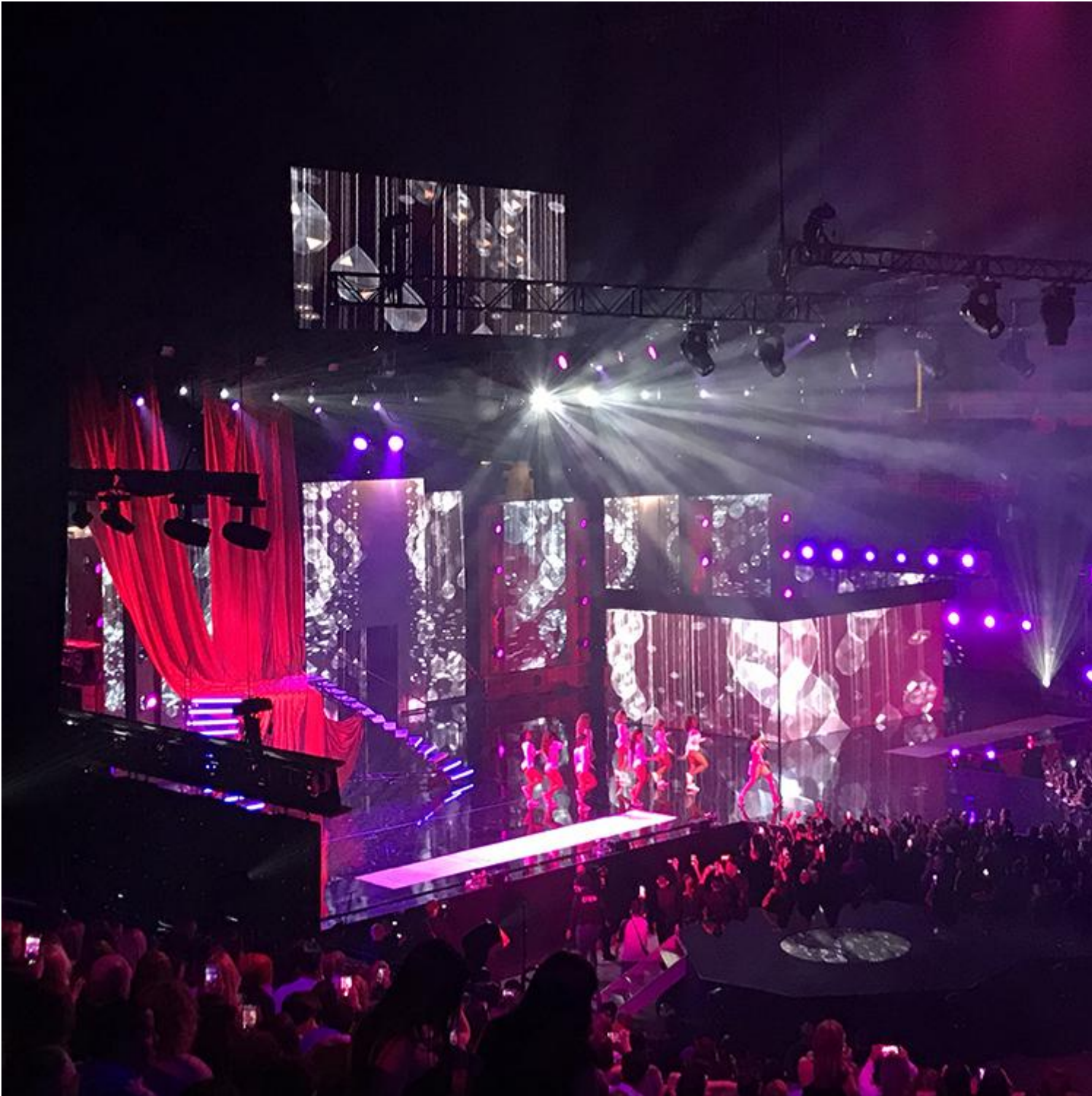
Premios Tu Música Urbano

people in 52 countries – almost four times the audience for the Grammys. For this production, JMT was responsible for all media servers, including fibre optics, programming, concepts and content creation.