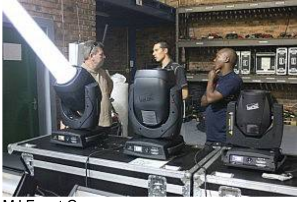
MJ Event Gear