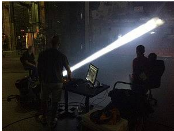
At the Playhouse

The clients were all exceptionally accommodating and hospitable and went out of their way to be part of this experience. "An enormous than you to everyone we went to see," ended Rob.