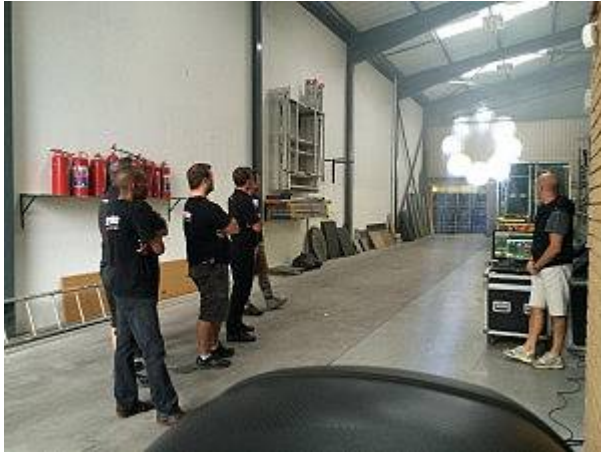
Thanks for having us Hirezone