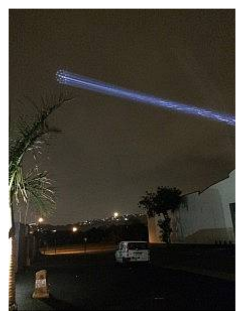
819 'likes' makes this picture the second most liked image on the Clay Paky Facebook page of all time.

The <u>MYTHOS</u> is state of the art in versatility. It is an effects projector with a very wide zoom range (4°-50° / 1:12) and a beam mode with 0.5° beam angle that produces a 170-mm-diameter (6½") thick parallel ultraconcentrated light beam. The wash light effect is amazing too. The Mythos won the Plasa Award for Innovation. The jury gave the following reasoning: "In the Clay Paky tradition, it's a real winner. Paky would be proud."