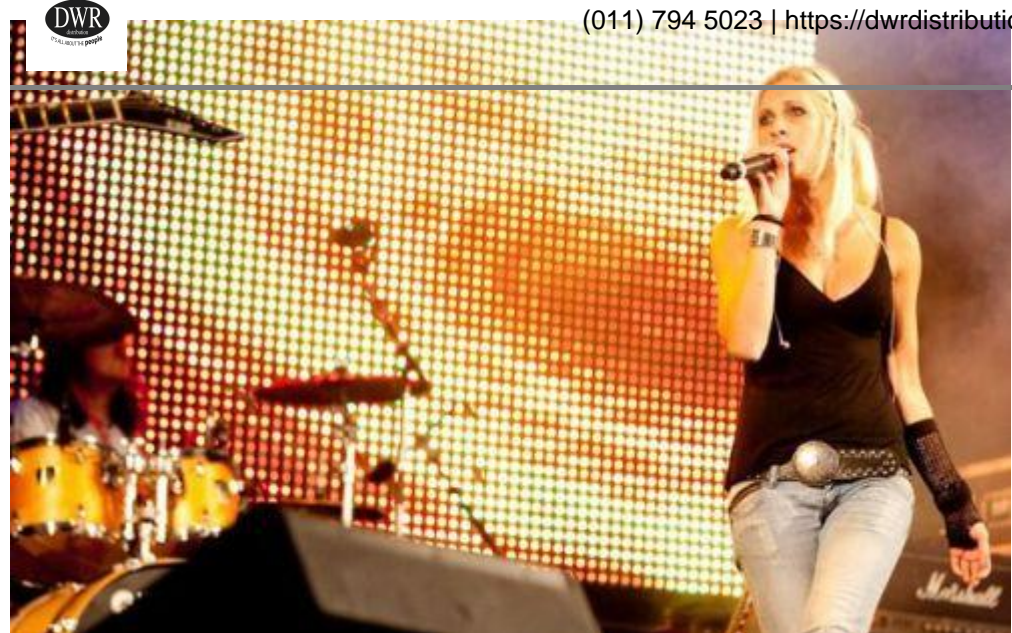
"The client, C2, were absolutely

(011) 794 5023 | https://dwrdistribution.co.za | sales@dwrdistribution.co.za