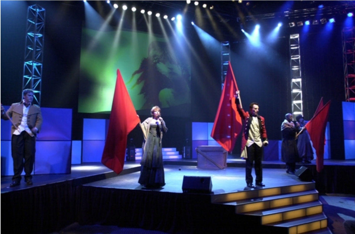
Delta's 10th Birthday