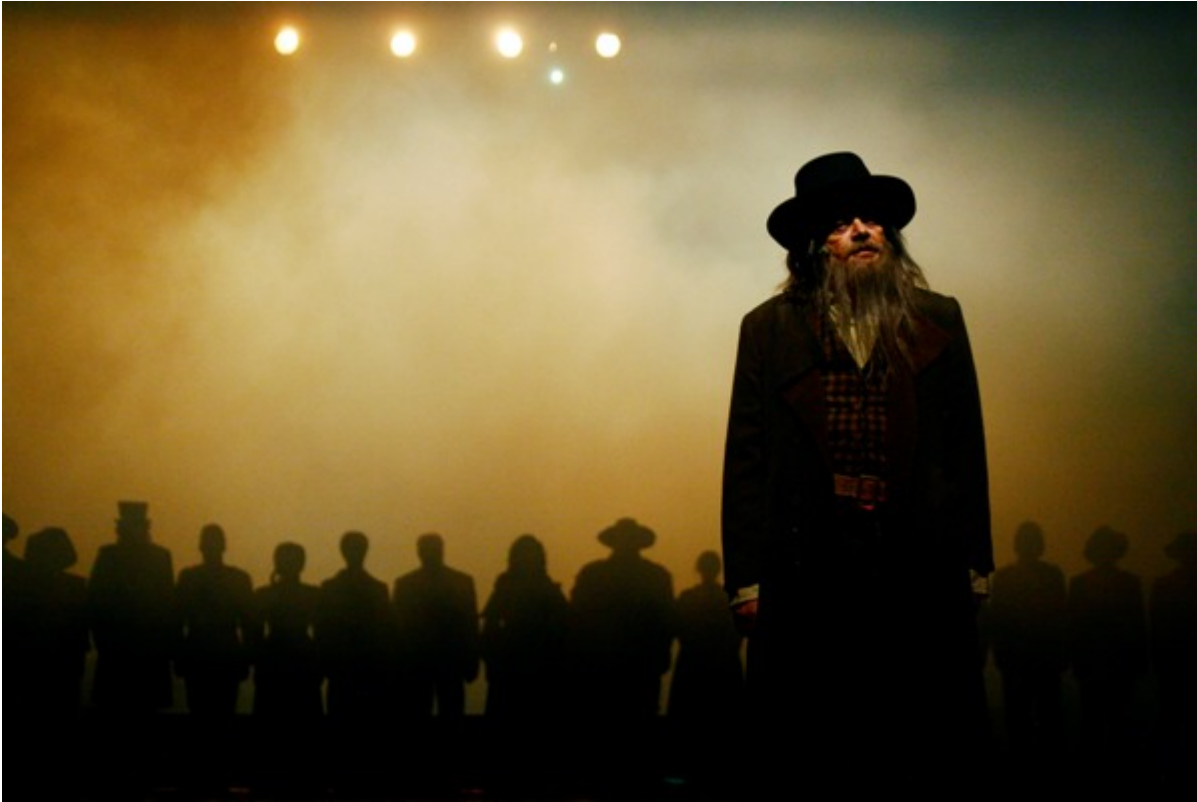
Ons vir jou