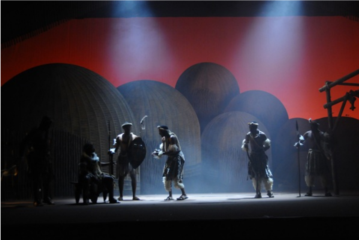
ShakaZulu by E Meyberg

“Of course the production we did in the Cango Caves will always stand out; the beauty of the caves when lit from different angles and in colour was just awesome.”