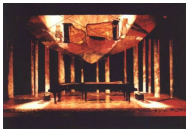
A Handful of Keys, the original version (set & lighting)