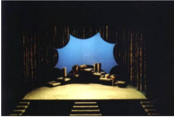
Umoja – Shaftsbury Theatre London (set & lighting)