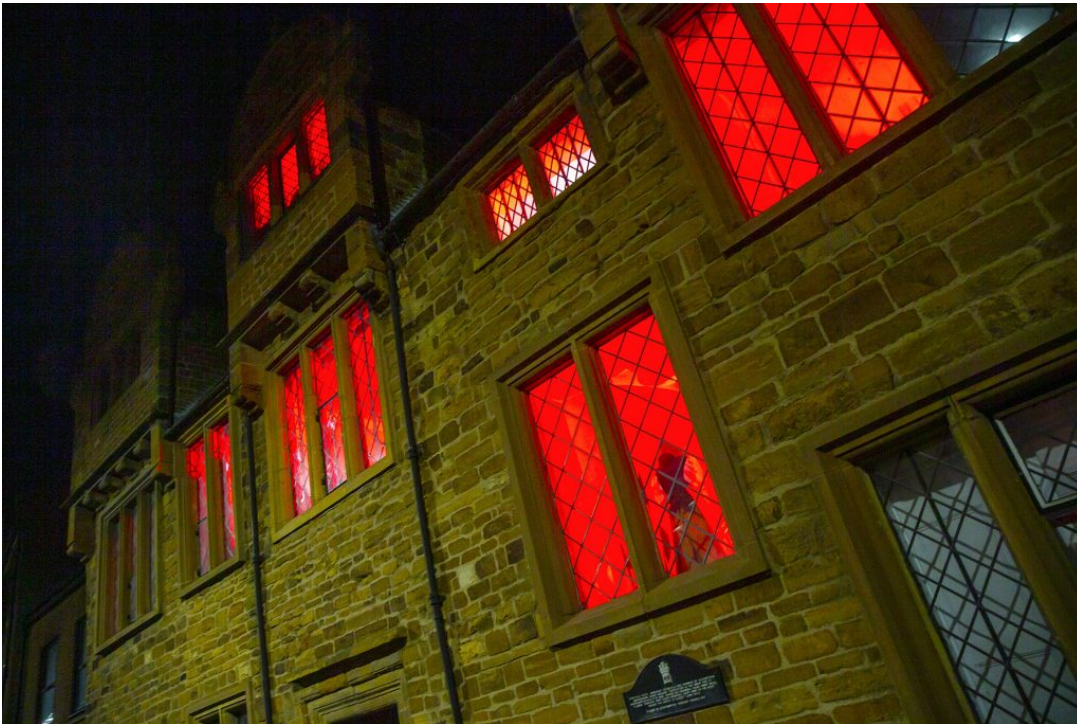
Looking Glass Theatre.

Performing arts, live music, shows, and events are a massive source of enjoyment, employment and revenue for so many, and a commercial and creative lifeblood for the community of Northampton and multiple other places.