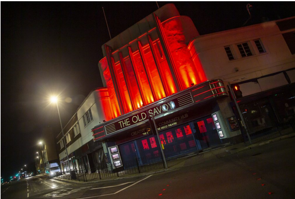
The Deco.