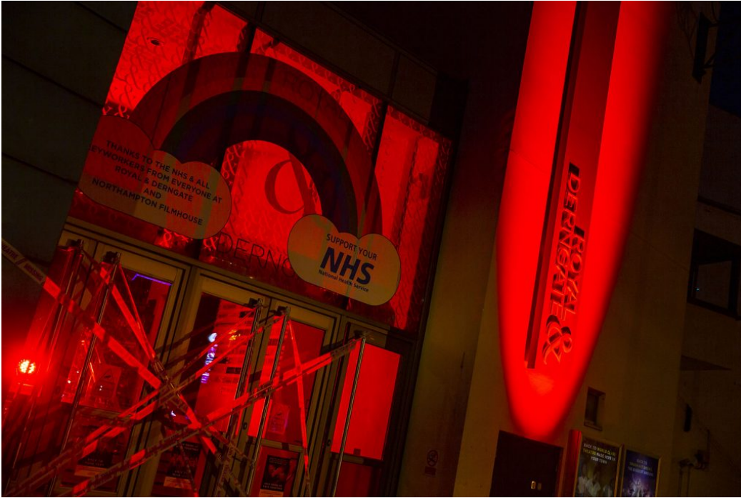
Northampton Red, Royal and Dergate.