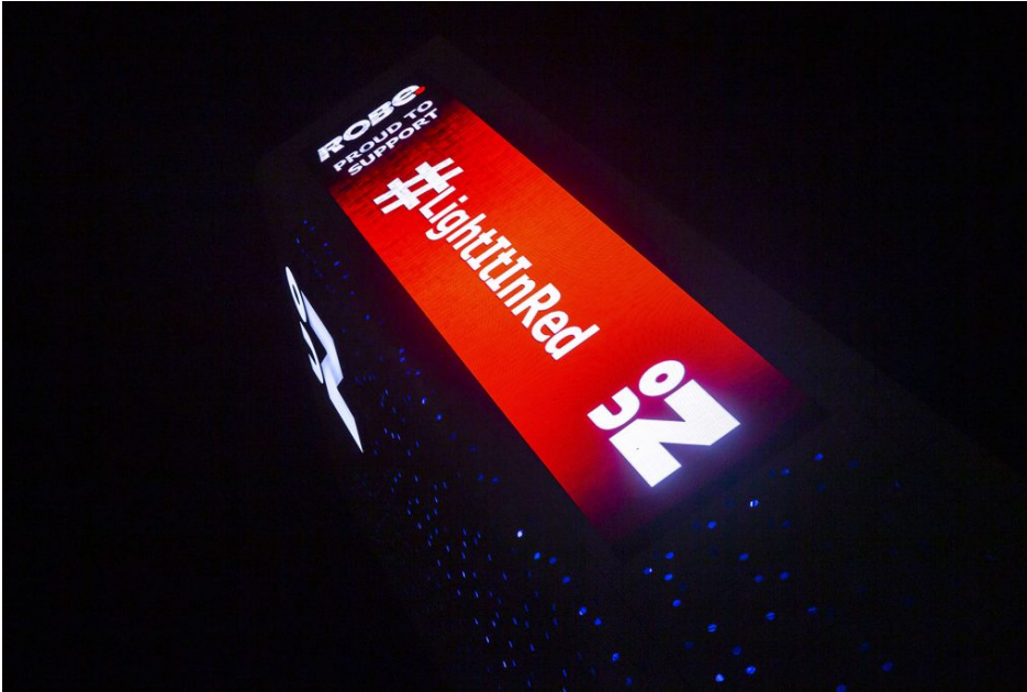
University of Northampton.

Over six hundred and fifty illuminations were on the #LightItInRed map dotted all over the UK in a highly successful show of cohesion in these anxious times.