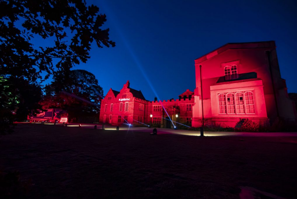
Delapre Abbey.