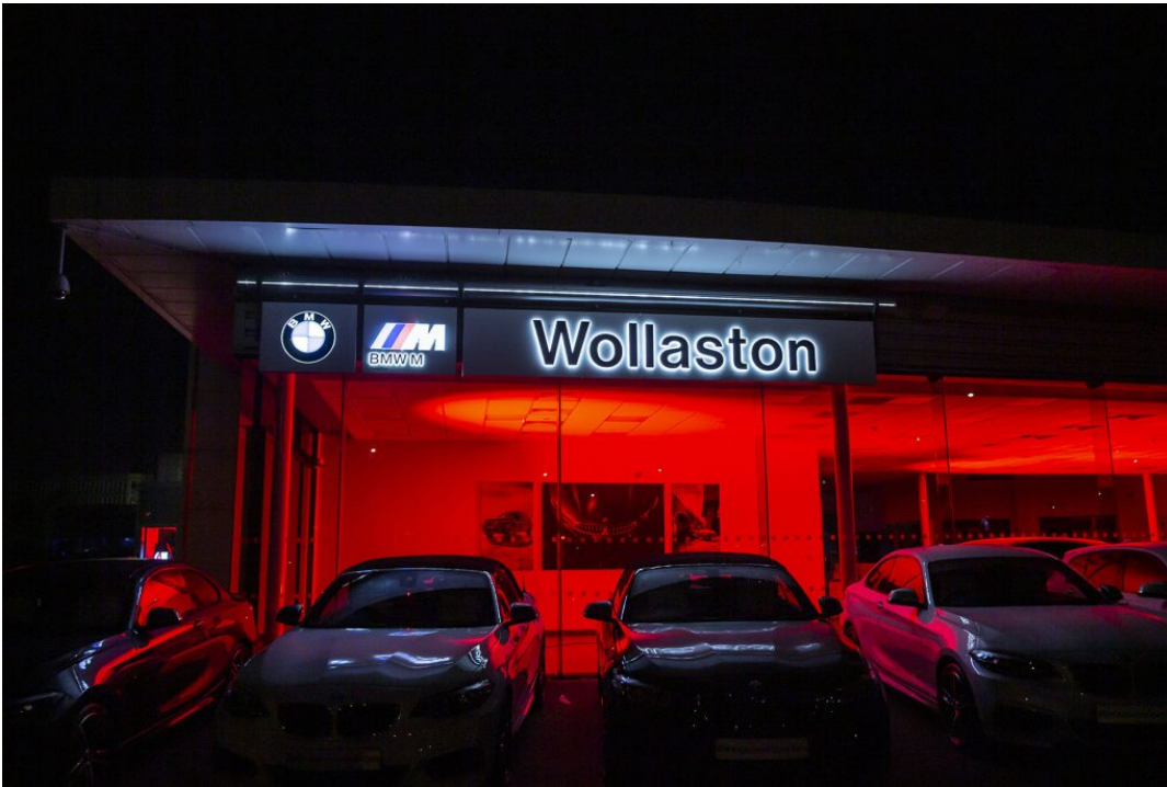
Ithorp House.

Robe UK was extremely proud to work with a number of companies, organisations, venues and individuals to light ten significant buildings and landmarks in and around its hometown of Northampton ... for the #LightItInRed lighting action campaign on Monday night, 6 th of July.