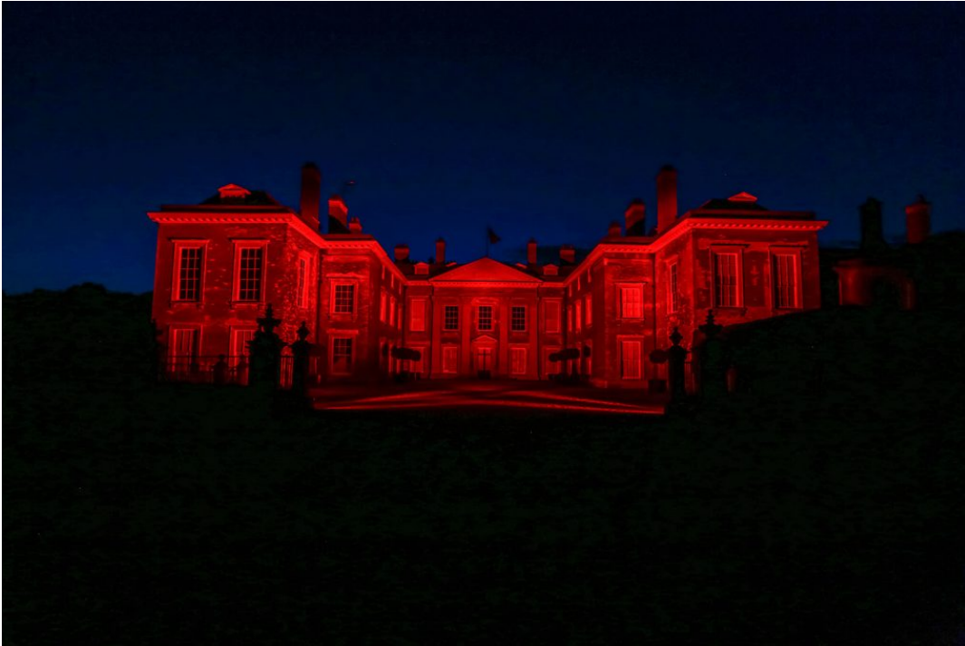
Althorp House.

The front façade of the magnificent stately home of Althorp House – home to the Spencer family for the last 500 years – was illuminated in striking scarlet with four Robe Spiiders LED and two LEDWash 600+ wash beam luminaires as the current Lord Spencer – a keen patron of the Northampton & Derngate Theatre and the arts – himself signalled support for the action.