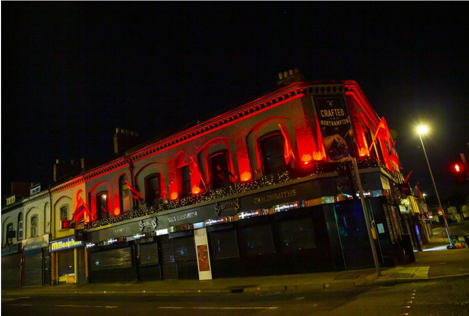
Steffans Jewellers.