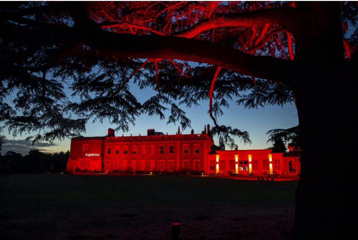
Delapre Abbey lit in red.