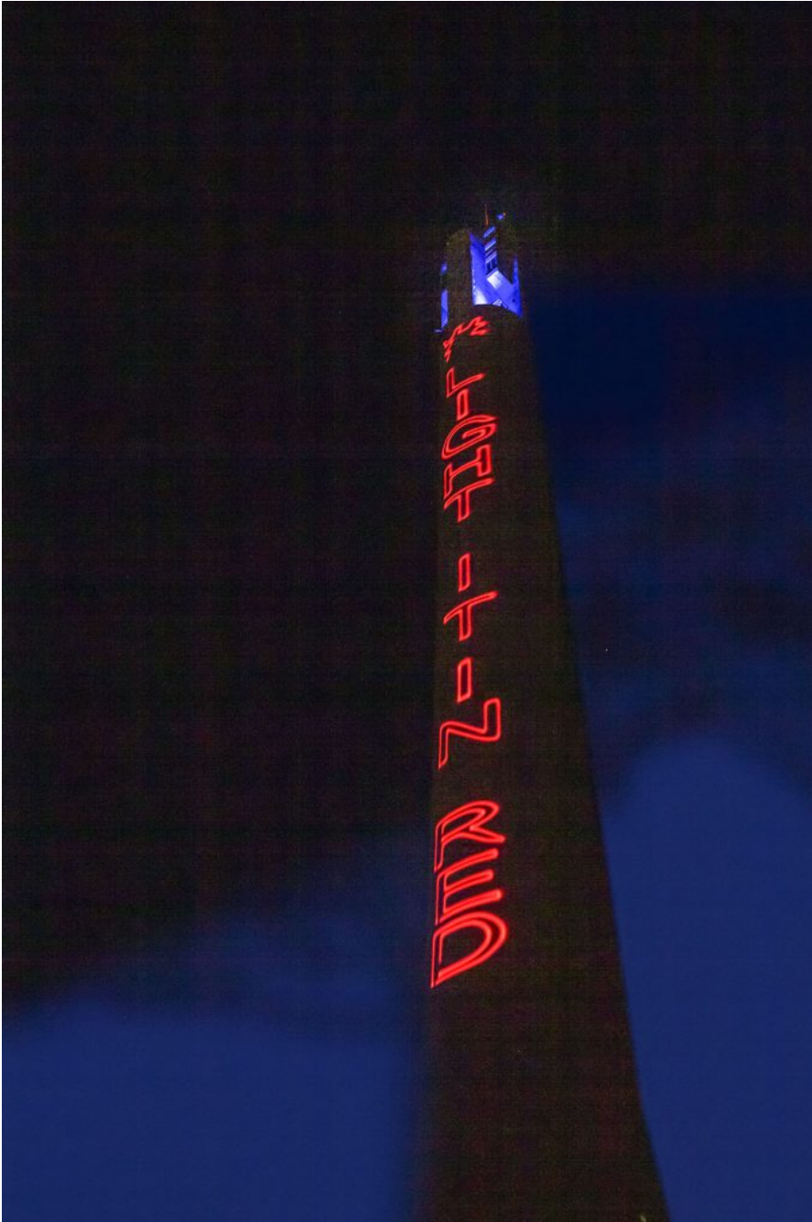
National Lift Tower.