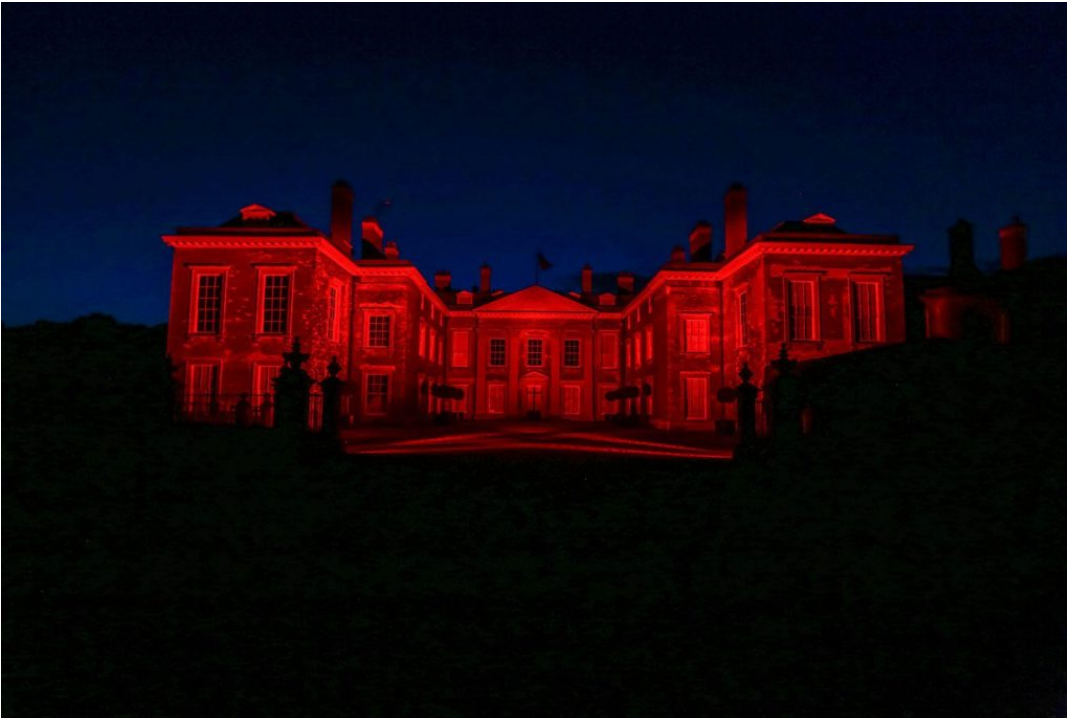
Althorp House.

Lord Spencer commented, “Althorp has held many live events, and I’m also proud to be patron of the Royal & Derngate Theatre in Northampton – so I was more than happy to show my solidarity with the live events and performance industries in the UK by allowing Althorp to be lit in red. I passionately believe in what #LightItInRed wanted to highlight.”