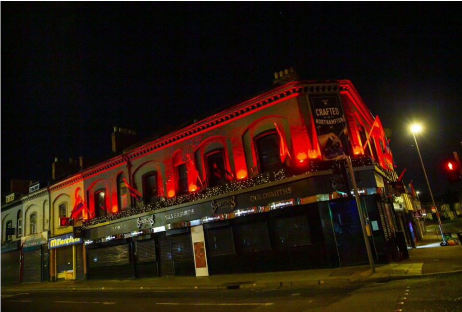
Steffans Jewellers.