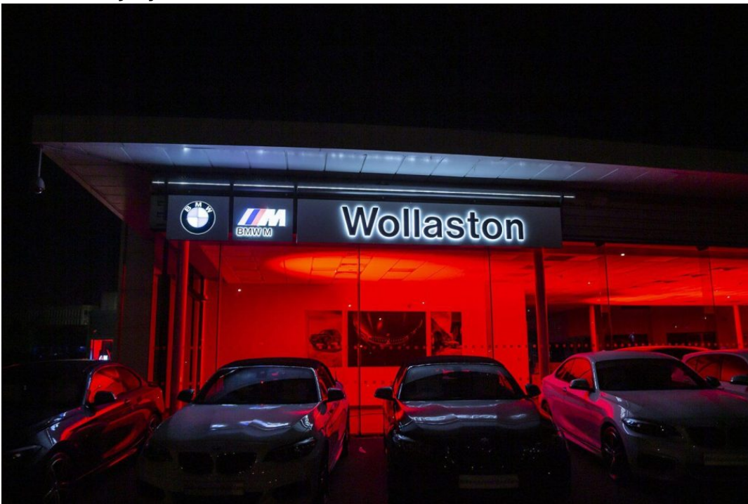
Ithorp House.

Robe UK was extremely proud to work with a number of companies, organisations, venues and individuals to light ten significant buildings and landmarks in and around its hometown of Northampton ... for the #LightItInRed lighting action campaign on Monday night, 6 th of July.