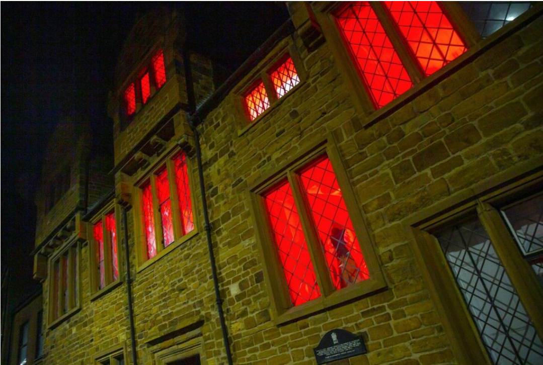
Looking Glass Theatre.