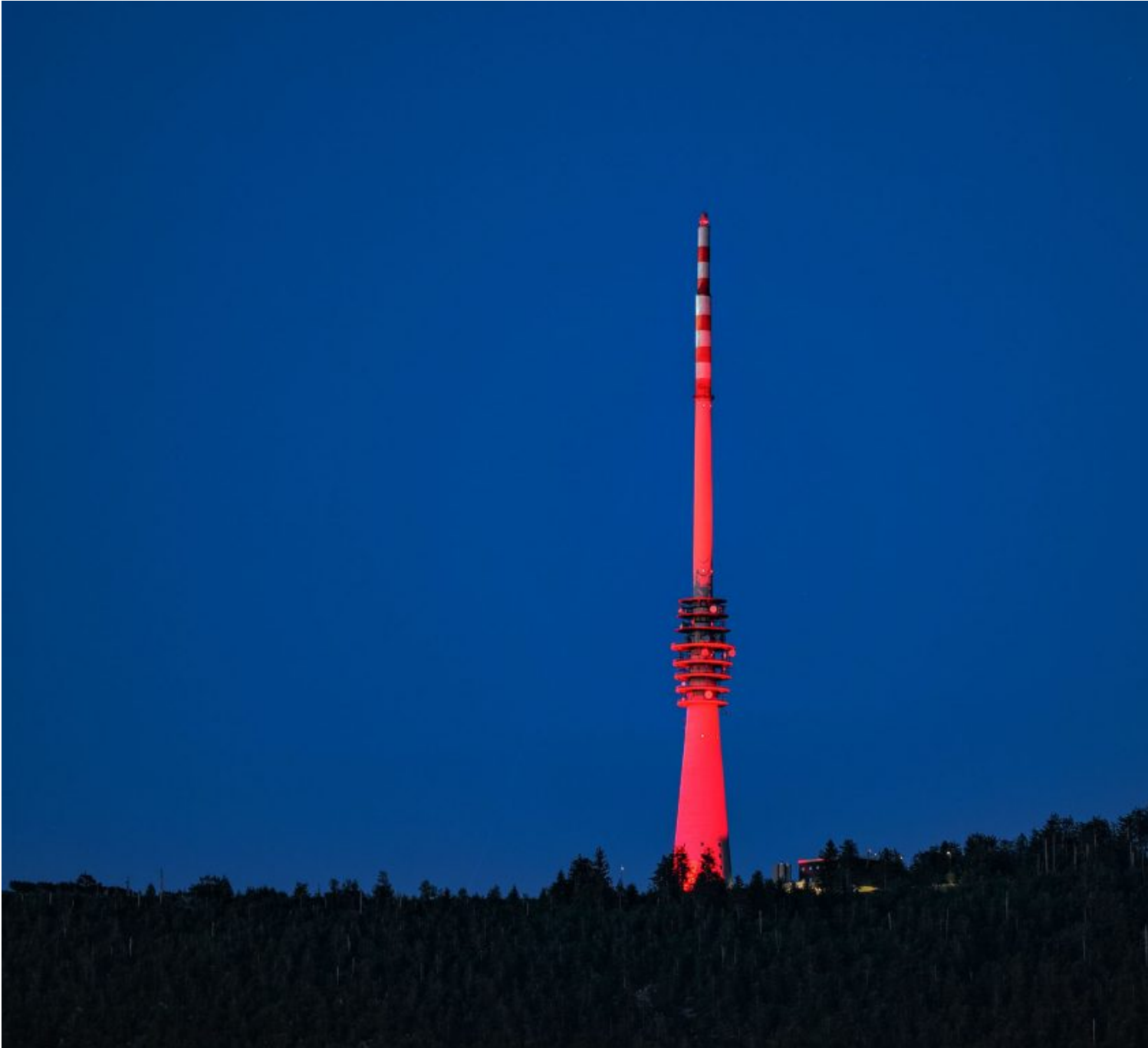
Hornisgrinde by Andreas Baßler

The planning and lighting design were extensively tested and visualised in Depence 2 by Manuel before specifying the lighting fixtures and determining their optimum placement.