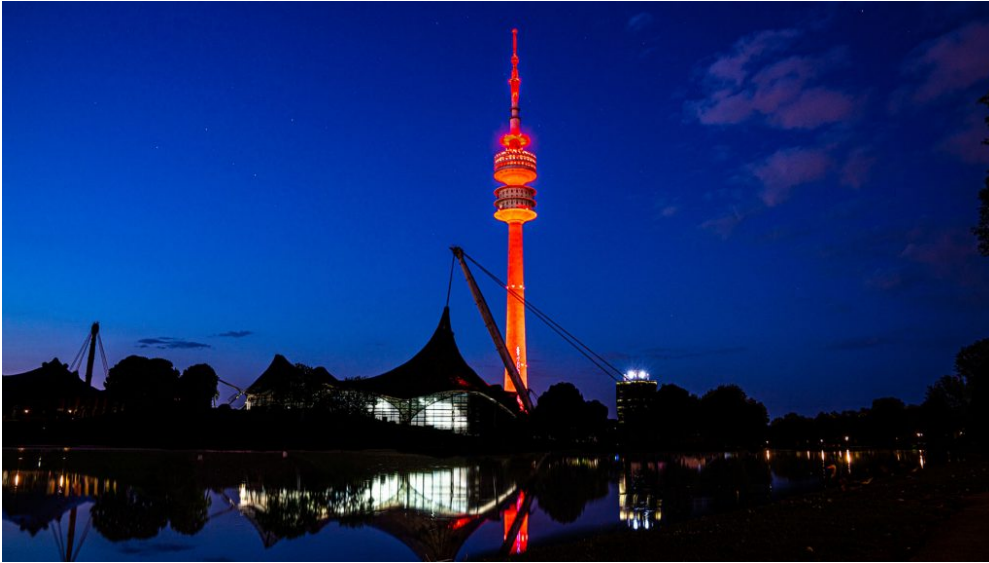
Olympia Tower

They used 68 x Robe moving lights – 36 x LEDBeam 150s, 16 x MegaPointes and 16 x ESPRITES.