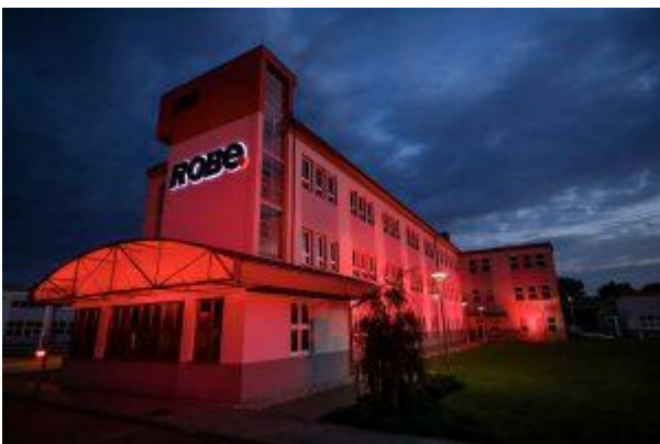
Robe HQ Valmez