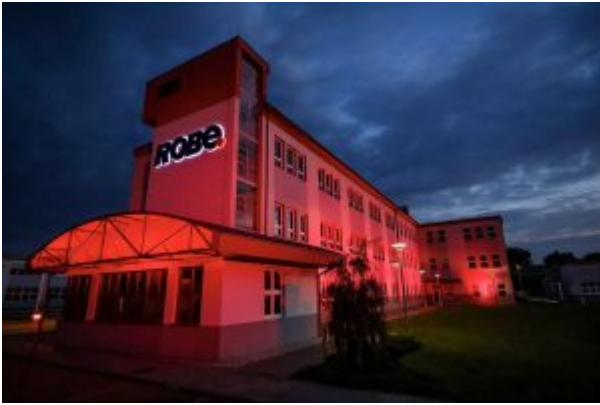
Robe HQ Valmez