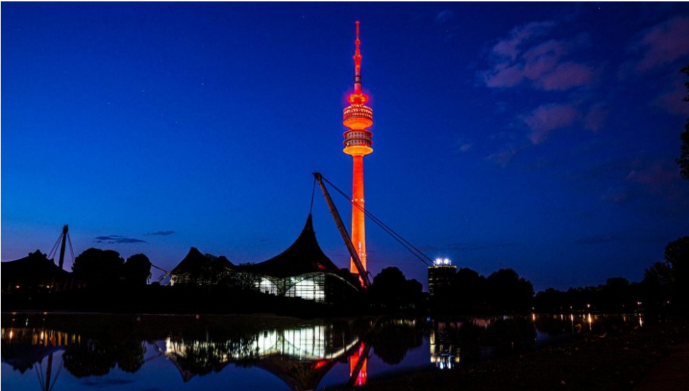
Olympia Tower – Courtesy Magic Event & Medientechnik GmbH

They used 68 x Robe moving lights – 36 x LEDBeam 150s, 16 x MegaPointes and 16 x ESPRITES.