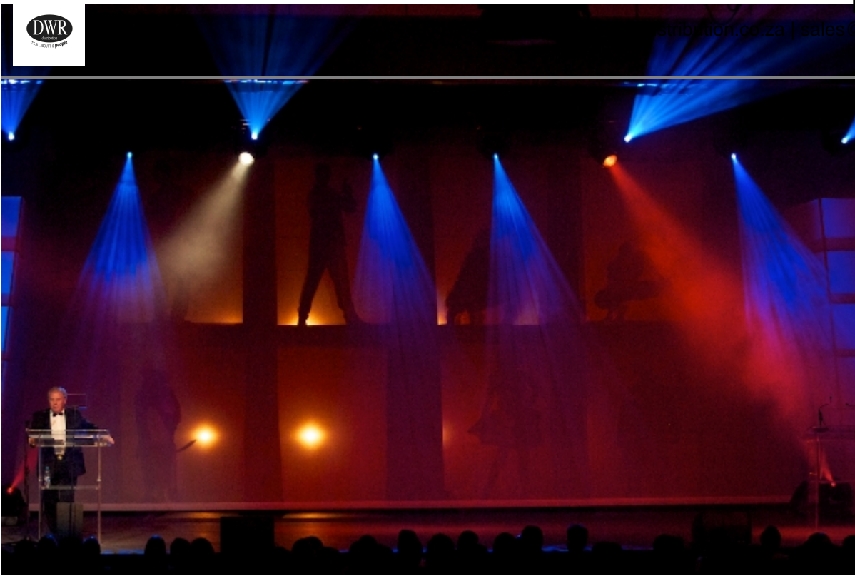
This lighting rig

included 4 x Vari-lite VLX Wash lights, 6 x Martin Mac 600 Wash , 4 x Martin Mac 250 Wash, 8 x Martin Mac 700 Profiles, 4 x Martin Mac 250 Entour , 24 Etc Source 4, Le Maitre Hazers and a range of other generics for ambient lighting.