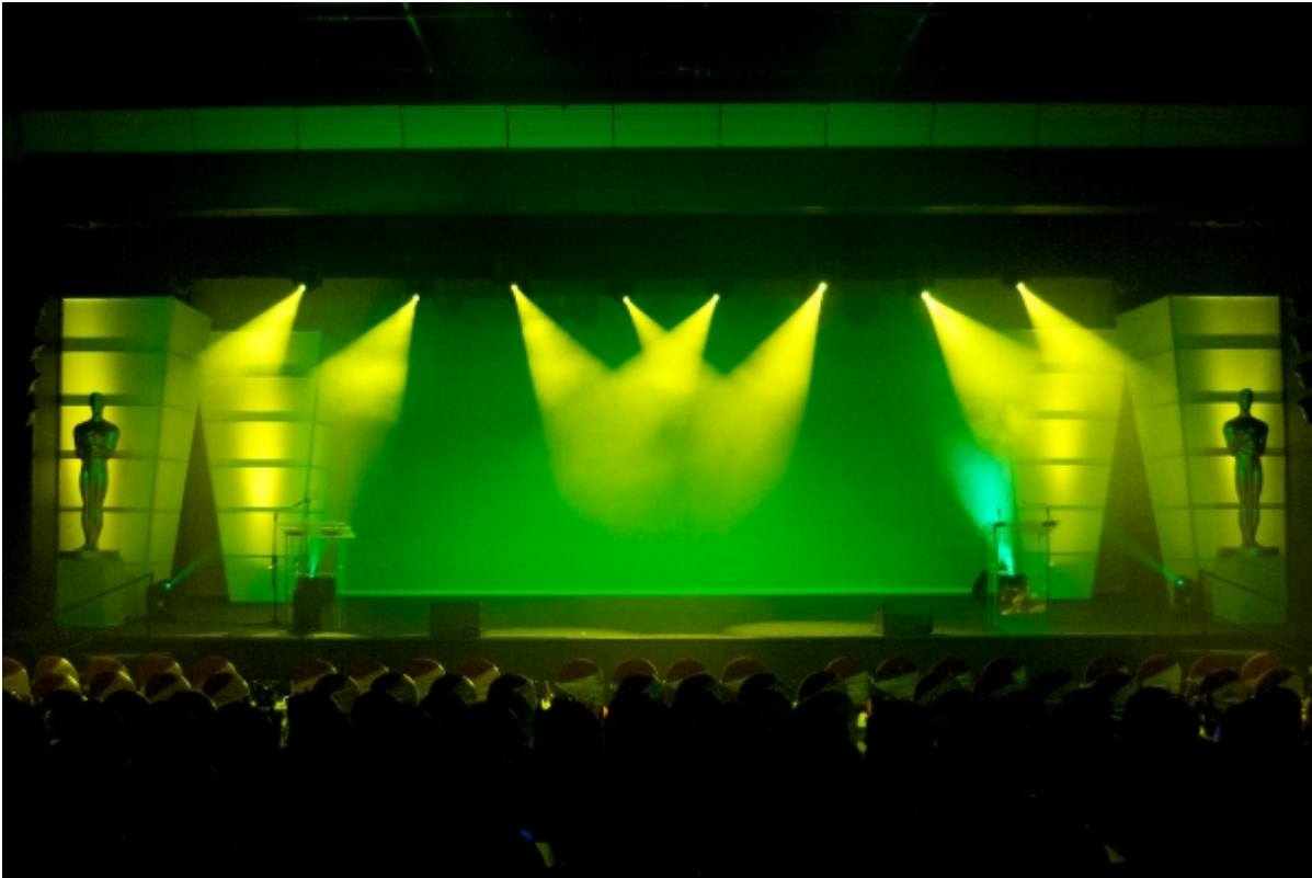
The Oscars was

the theme for this year's Caxton Awards, held at The Theatre on the Track on 29 March 2012.