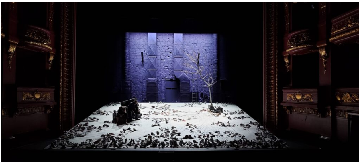
À Espera de Godot/Waiting for Godot

The purchase brings TNSJ's total complement of Dalis Access 863 units to 34. This is more than sufficient to cover the theatre's 12m x 9m cyclorama cloth and back wall from floor- and grid-mounted positions, plus fill in as 'ribalta' lighting when required.