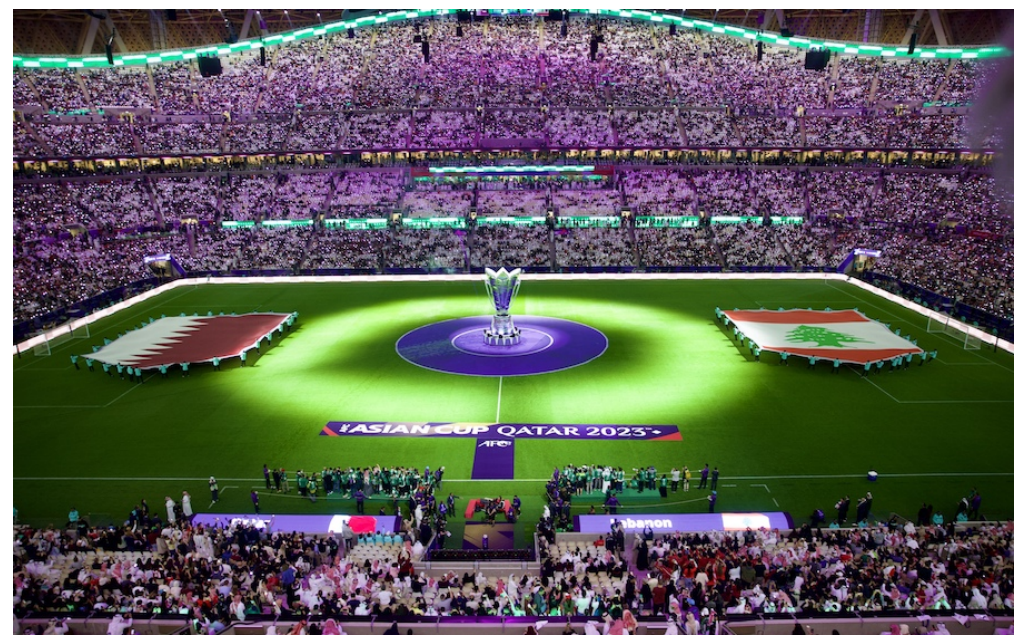
A view of the stadium ahead of the 2023 AFC Asian Cup Group A football match between Qatar and Lebanon at Lusail Stadium in Lusail, Qatar on January 12, 2024.

Among the tasks that Qvision was charged with were the implementation of comprehensive technical AV overlays across all nine stadiums; the development, production, and delivery of stadium infotainment for all 51 matches; leading the creation of bespoke pre-match ceremonies; and orchestrating the coronation ceremonyand fireworks finale. Qvision also curated engaging Fan Zone activations, fostering an immersive and enjoyable environment for all attendees.