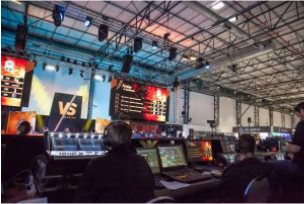
Comic-Con Main Stage