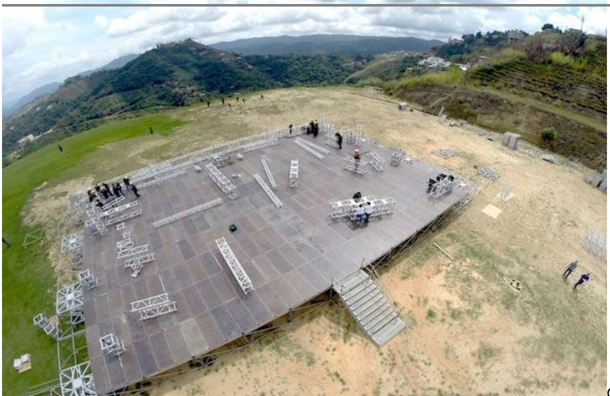
Operating in the

Latin American market, the Venezuelan based PROmontaje needed a solution to host large outdoor events and concerts. PROmontaje owns a large event site, just outside Caracas, which they plan to use for a range of outdoor concerts and sports events. PROmontaje is the main provider of technical resources for events in Venezuela, and dedicated to supplying the best possible technical resources for the production of sporting events, shows and corporate events.