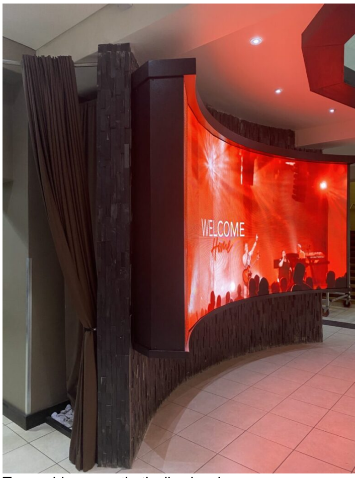
To provide an aesthetically pleasing appearance, DWR created a sheet metal cladded border around the entire Absen screen.

was relevant then is real and modern in Maranatha's 3 000 auditorium and counselling centre today.