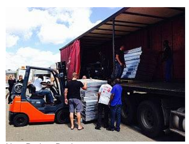
New Prolyte Decks

When they work, they work hard and when the play they go fishing. But now, Namibian rental company, Mikel-Jes Productions, have purchased a 10m x 8m Prolyte MPT Roof with Wings, 16 x StageDex, Prolyft Motors and Robe fixtures including 12 Pointes, 6 Robin 300s and 12 LED Beam 100s – this should keep them busy for a while!