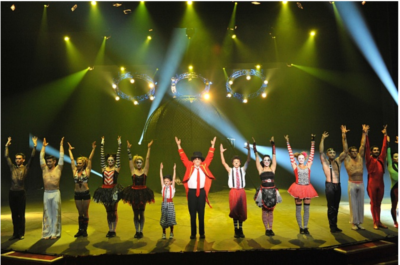
Photo courtesy Mariola Biela Many thanks to the Joburg Theatre for the beautiful show photos Le Grand Cirque de Adrenaline thrilled a South African audience with breathtaking performances