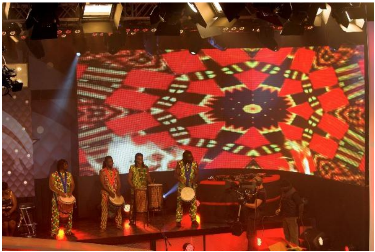
Christiaan Ballot from Blond Productions used LAMP for Big Brother All Stars, 2010 DWR Distribution are pleased to offer the industry LAMP full colour video LED display units.

Local rental companies became familiar with the brand three years ago and owners of LAMP include Complete Event Solutions, C & S, Eventech and Blond Productions.